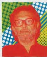
RAKEYSH OMPRAKASH MEHRA