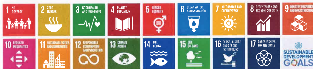
Ramu Damodaran Chief, United Nations Academic Impact Department of Public Information United Nations

as its hub for Sustainable Development Goal 1 for 2018-2021.