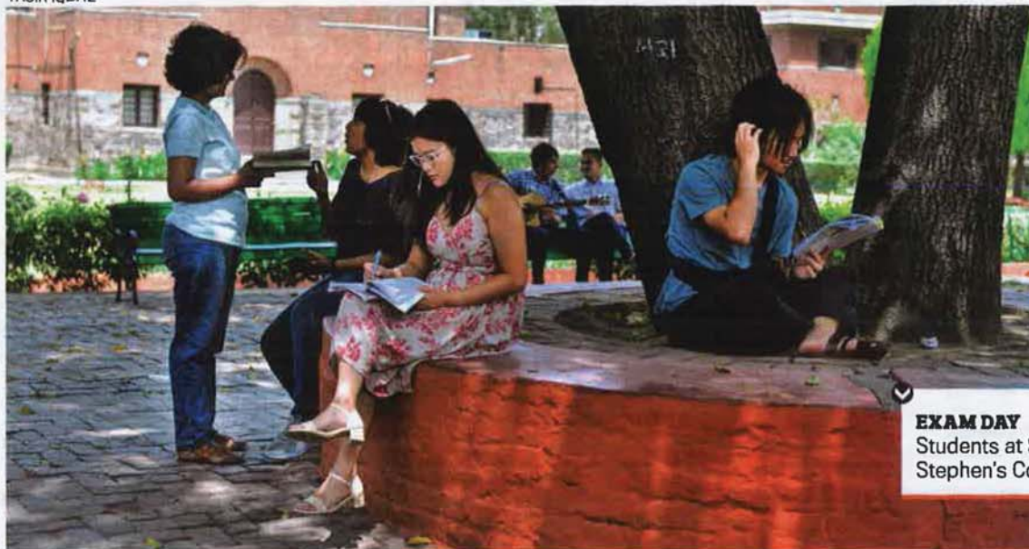
EXAM DAY Students at St Stephen's College