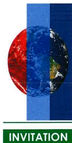
Invitation for the felicitation ceremony