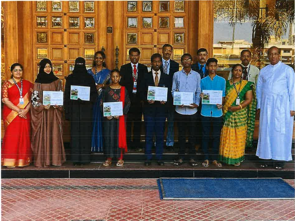
The Prize winners of the 7 th National Green India Essay competition after the felicitation ceremony with the honorable Fathers, Dean and HOD of the Life Sciences Department, and the staff coordinators