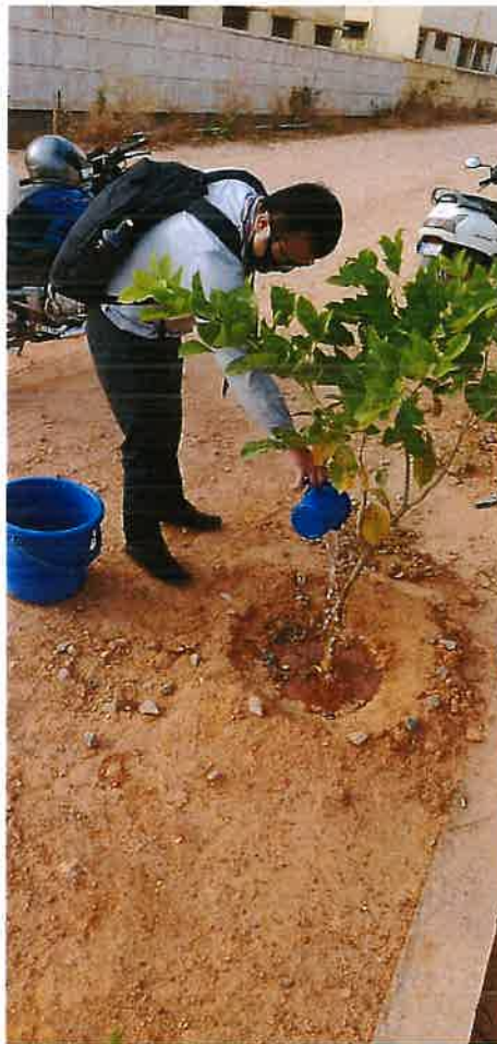
The grown sapling watered by one of our student