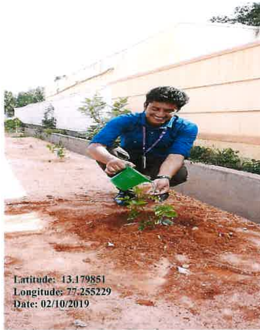
Student watering the sapling planted