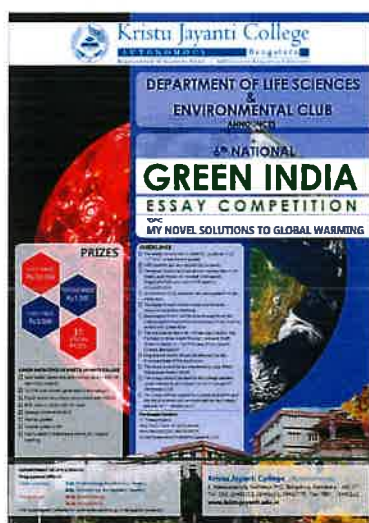
Poster of the 6 th National

The National Green India Essay competition is an annual event organized by the Department of Life Sciences in association with the Environment Club for Higher Secondary School students of Indian and International schools. The competition endeavors to create awareness and sensitize the youth on environmental issues. Through this event, the Department strives to make the youth conscious of their responsibilities toward the environment and practice the principles of reduction, reuse, and recycling of resources. The 6 th version of the event was announced in October 2018. The topic for the essay writing was “ My Novel Solutions to Global Warming ”.