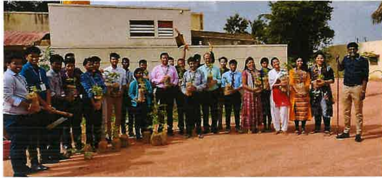
Students with the faculty members