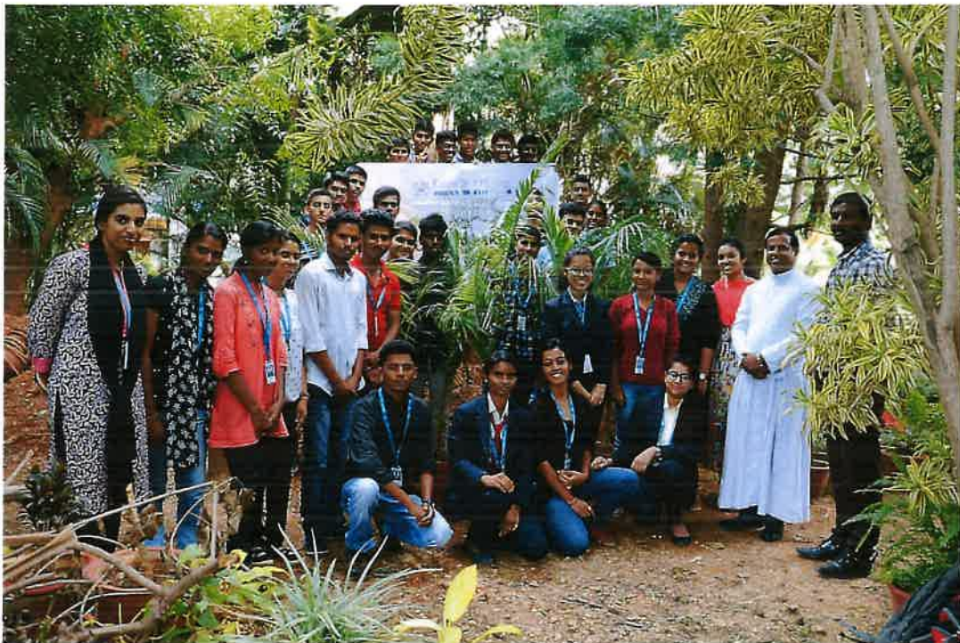
Photo: NCC team who were part of the Green Campus Day, 14/09/2017