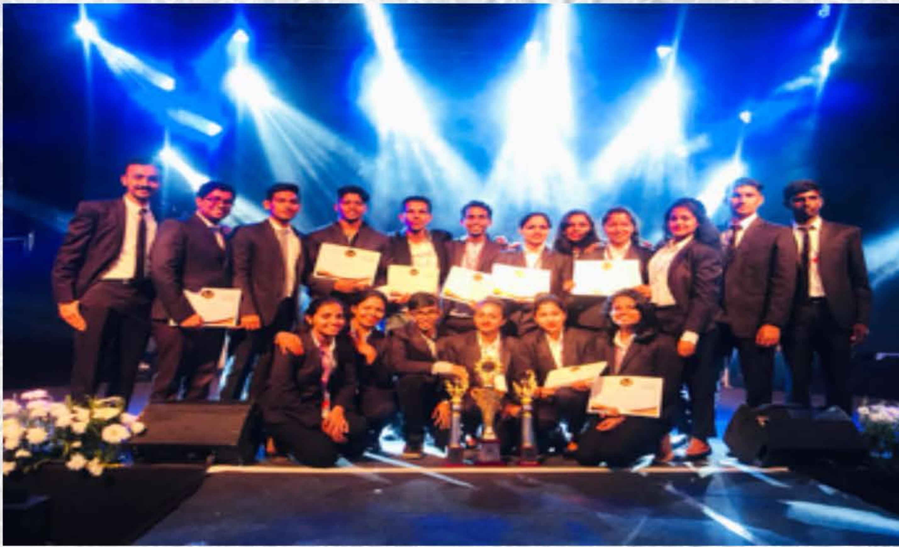
CALIGO 2K18 MARIAN INSTITUTE OF MANAGEMENT OVERALL WINNERS