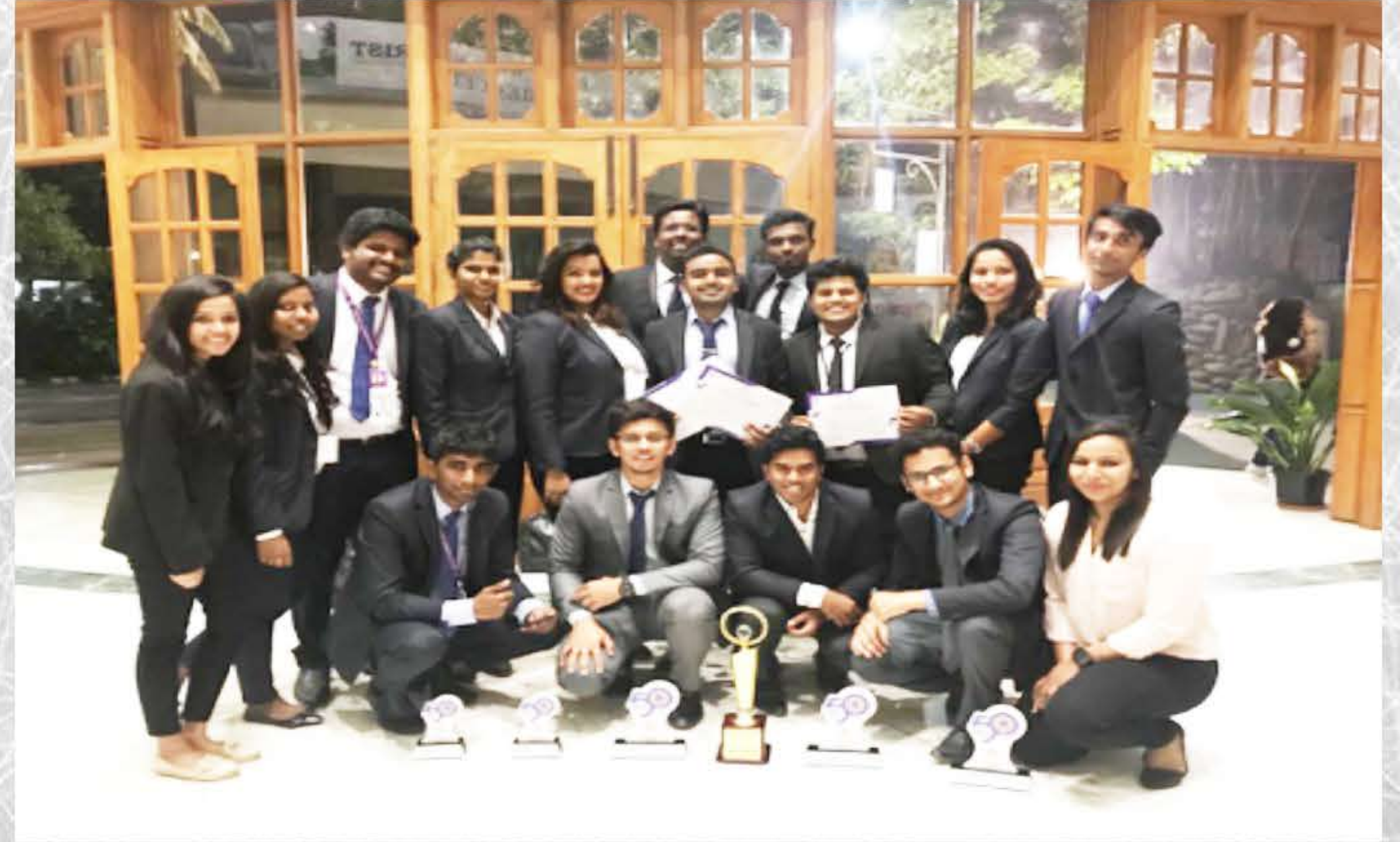
USHUS 2018 CHRIST (DEEMED TO BE UNIVERSITY) OVERALL WINNERS