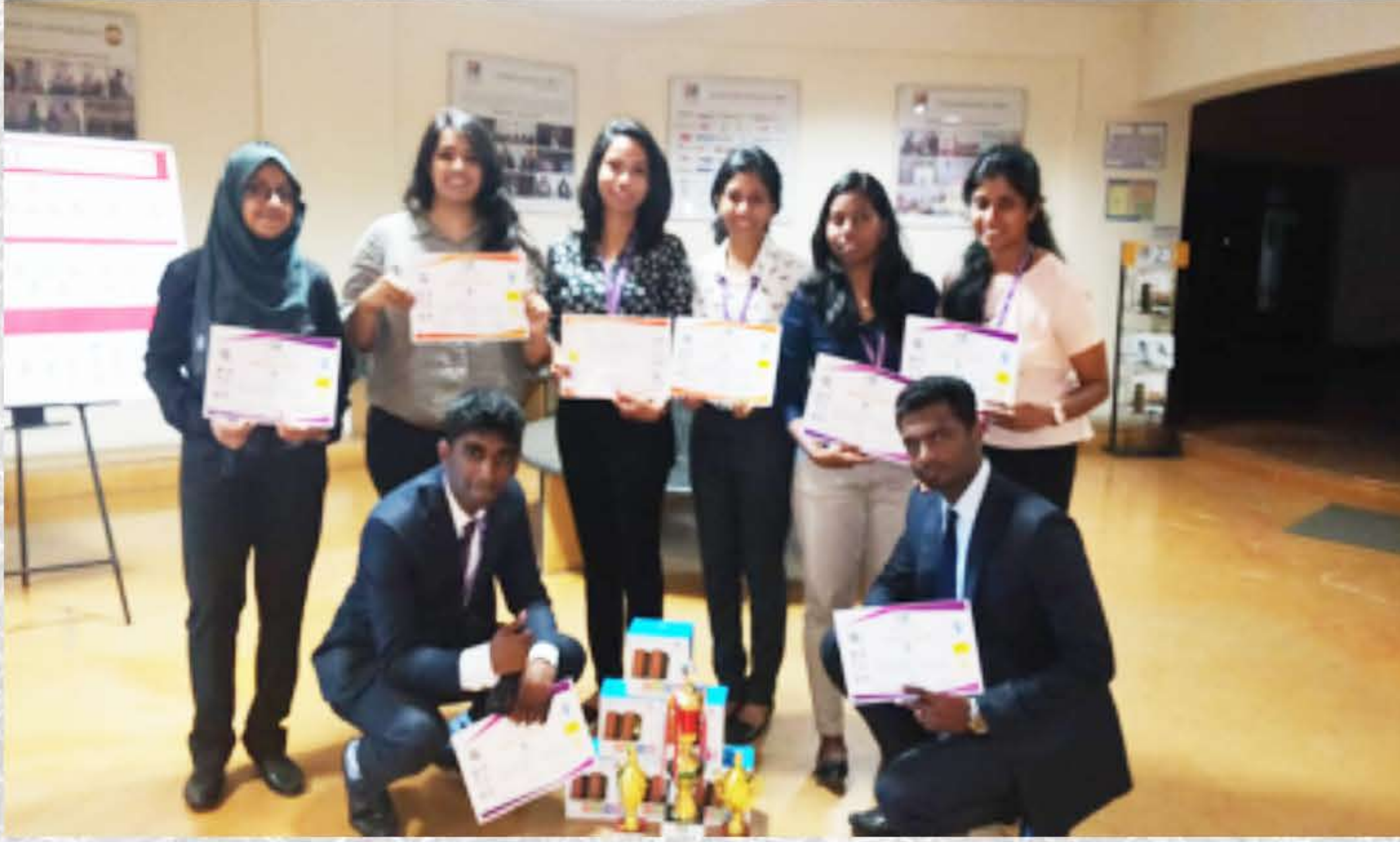
NAMAN 2K18 IFIM OVERALL WINNERS