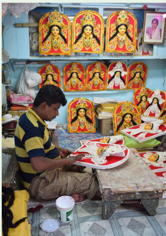
An artist makes Durga Idols in Kumartuli

There are a lot of hubbubs all around West Bengal. There is the beautiful sound of the drum, with the people dancing to it. During Mahalaya, people in Kolkata get all decked up and go out with their families to enjoy their favourite festival. Every Bengali wears their traditional dress and goes out with their families to enjoy these five days. Kumartuli is the most memorable and