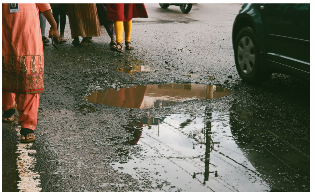
Potholes in the road

In other places, the edges of the carriageways are covered in silt, sand, and debris, forcing drivers to move into the middle of the road, which is also dotted with potholes. Traffic jams are common in K Narayanpura as a result of potholes, particularly during college hours. When the Kristu Jayanti College was founded