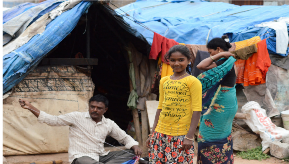
A scene from one of the slums in Bangalore.

People were drawn to the city to hunt for employment possibilities due to the expansion of private sector activity, particularly the IT sector and its ancillary sectors. The city does not, however, appear to have been successful in providing the necessary services and infrastructure for the expanding population. Poor migrants have been compelled to settle down in slums or squatter colonies in the city, in part because there is a shortage of cheap housing. Bangalore has seen an increase in the number of slum