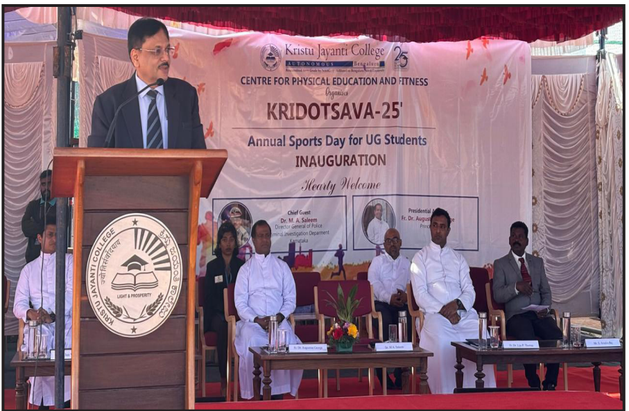
Building leaders through sports and unity

Kridotsava 2025 not only celebrated athletic excellence but also underscored