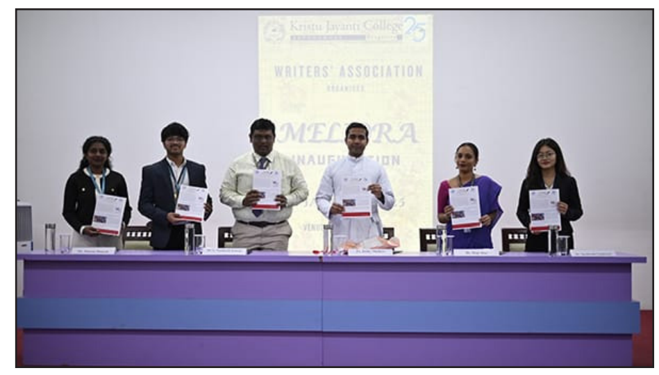
Kristu Jayanti College hosts Meliora, a vibrant literary fest

The Writers Association of Kristu Jayanti College, Bengaluru, hosted its vibrant intra-collegiate literary fest, Meliora, on January 16th, 2025. The event, marked by enthusiasm and fervor, attracted the participation of 168 students from various disciplines, all eager to showcase their literary and creative talents.