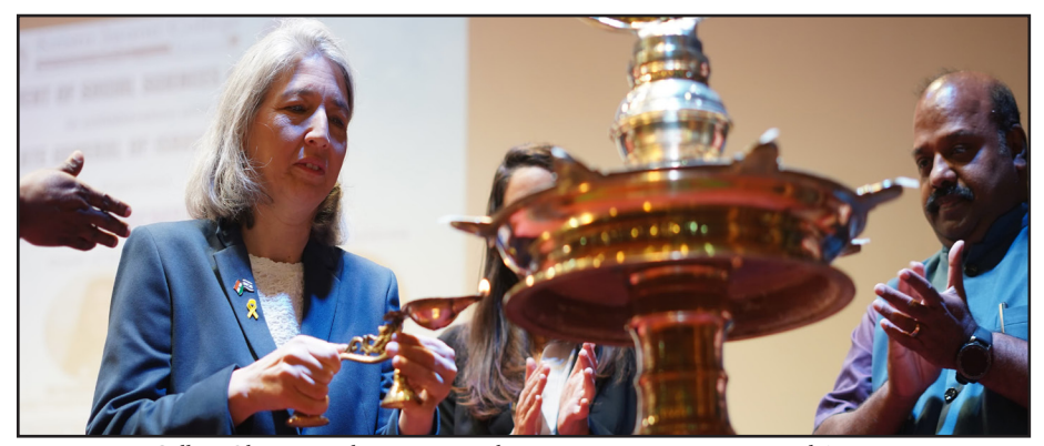
Kristu Jayanti College Observes Holocaust Remembrance Day, Promoting Peace and Awareness

On January 27, 2025, the Holocaust Remembrance Day was organized by The Consulate General of Israel, in collaboration with Kristu Jayanti College, Bengaluru. The event aimed to educate and reflect on the historical significance of the Holocaust and its global impact.