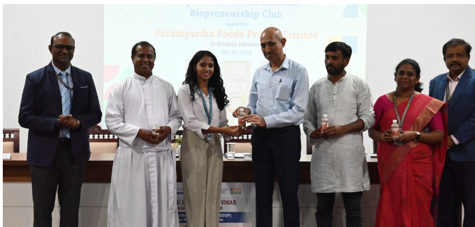
Launch of Paramparika Foods Pvt Ltd at the inauguration of Millets Mela

The event launched student-led ventures such as Paramparika Foods Pvt. Ltd., offering millet-based beverages, and Nutri24 Multigrain Mix by Agri Foods. It also unveiled the Kristu Jayanti Smart Agri App, developed by Computer Science students, featuring IoT-powered tools for farmers, such as real-time soil monitoring and market access solutions.