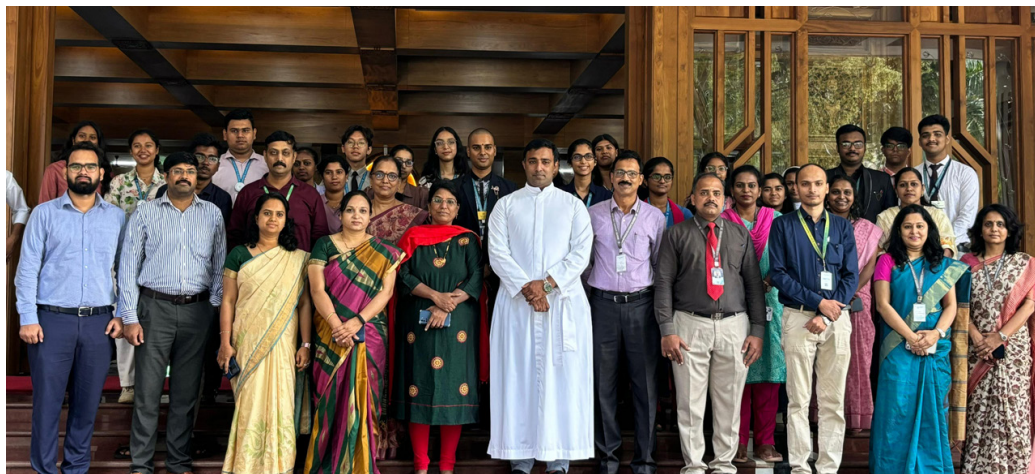
Kristu Jayanti Centre For Indian Knowledge System (KJCIKS) in collaboration with The University of Trans-disciplinary Health Sciences and Technology (TDU) organised an Ayurveda Health Camp