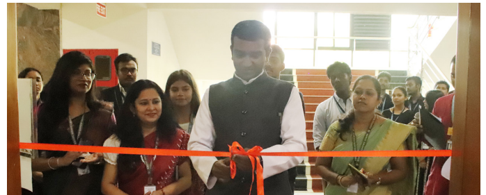
Kristu Jayanti College Hosts 'Sanskritika', Celebrating India's Cultural Heritage