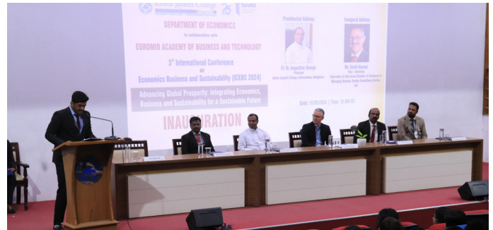
Inauguration of the 3rd international conference on Economics, Business and Sustainability