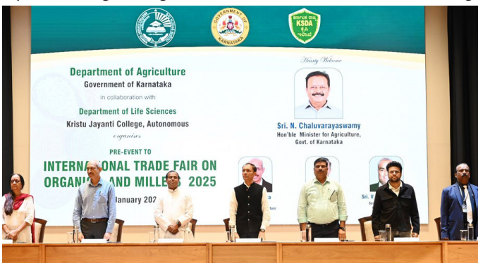
Pre-event to international trade fair on organics and millets 2025

products and discussions on their nutritional benefits and market potential. Students showcased innovative ideas for millet entrepreneurship, through a series of competitions including the sale of packaged millet products, elocution, Quiz and, Millet-Masterchef. The event also featured a panel discussion focusing on the role of millets in sustainable farming and entrepreneurship. The event was inaugurated with the dignitaries placing seeds of nine millets into an earthen pot, symbolising unity and sustainability, reflecting the International Year of Millets.