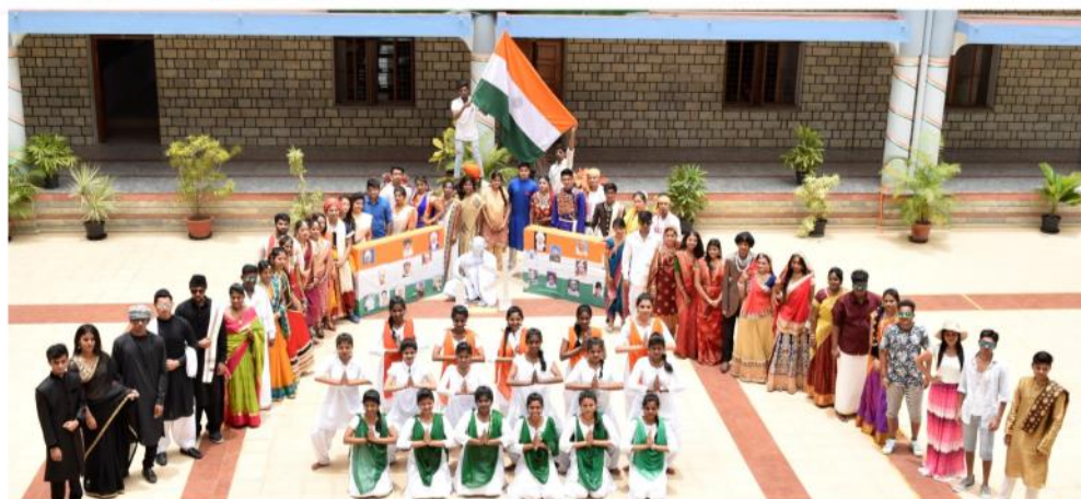
PATRIOTIC The students gathered for the Independence Day celebration.

DH News Service, Bengaluru, Aug 15 2017, 22:09 IST