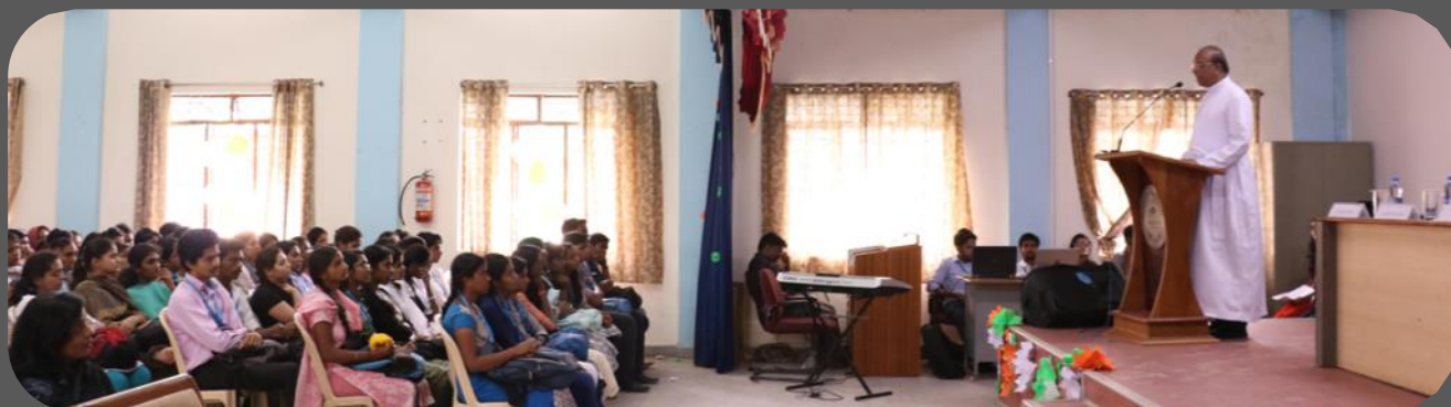
14 August 2017, Cultural Programme and Onstage events.