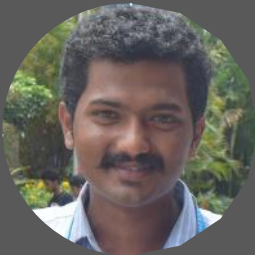
Abhideep III Sem BCom A