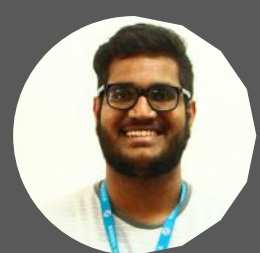
Nivad P Naushad III Sem BCom T (Photographer)