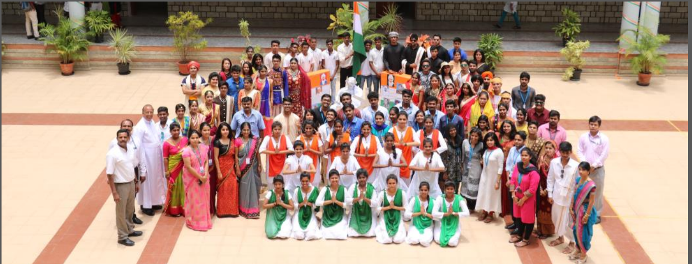
Jai Hind Programme Organized by the Department of Commerce Kristu Jayanti College (Autonomous) A Patriotism Breeding Programme