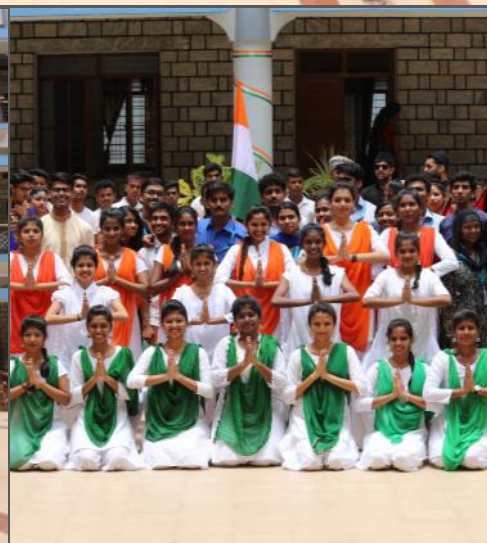
Group Photo: Jai Hind 2017 Team