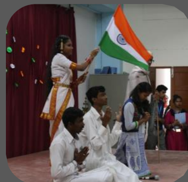
14 August 2017, Cultural Programme and Onstage events.