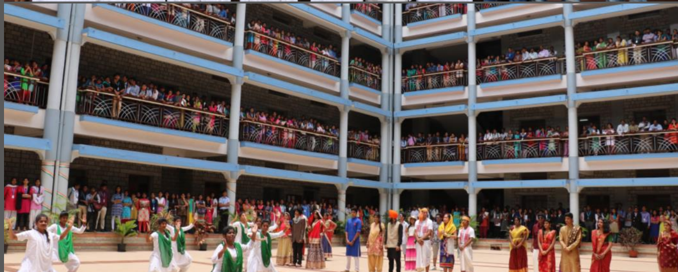
Group Photo: Ethnic Fashion Show Team and Cultural Team.