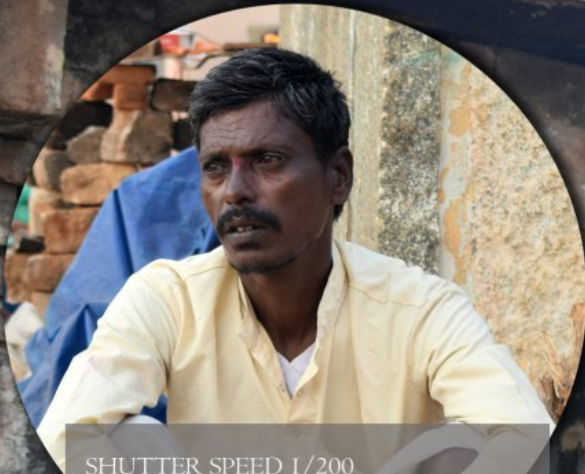
SHUTTER SPEED 1/200 ISO 400 F NO f/7.1