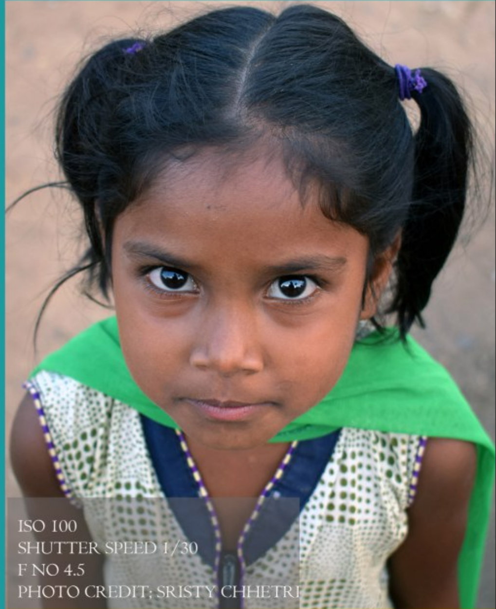
ISO 100 SHUTTER SPEED 1/30 F NO 4.5

According to HUMANIUM – an international child NGO, about 58 million children in the world have no access to education just because they cannot afford to attend an educational institutions. Less than half of India's children between the ages of 6 to 14 go to school. Even though education is a human and fundamentalright, many children like Vaishnavi do not get the chance to attend school due to poverty. Also, Girls are far less likely to attend school compared to boys.