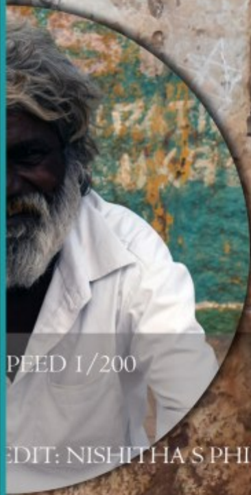
SHUTTER SPEED 1/200