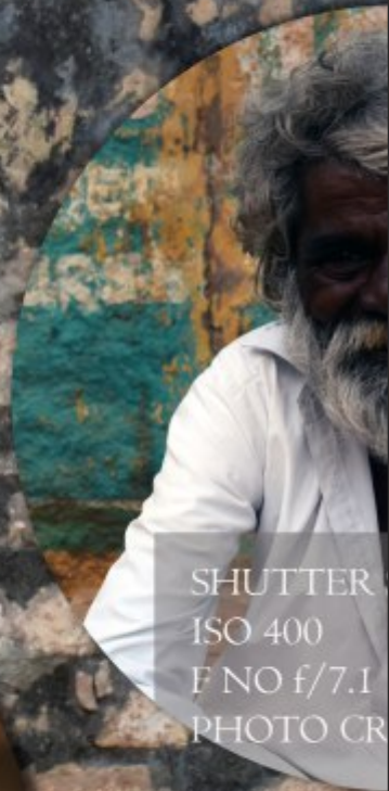
SHUTTER ISO 400 F NO f/7.1 PHOTO CR