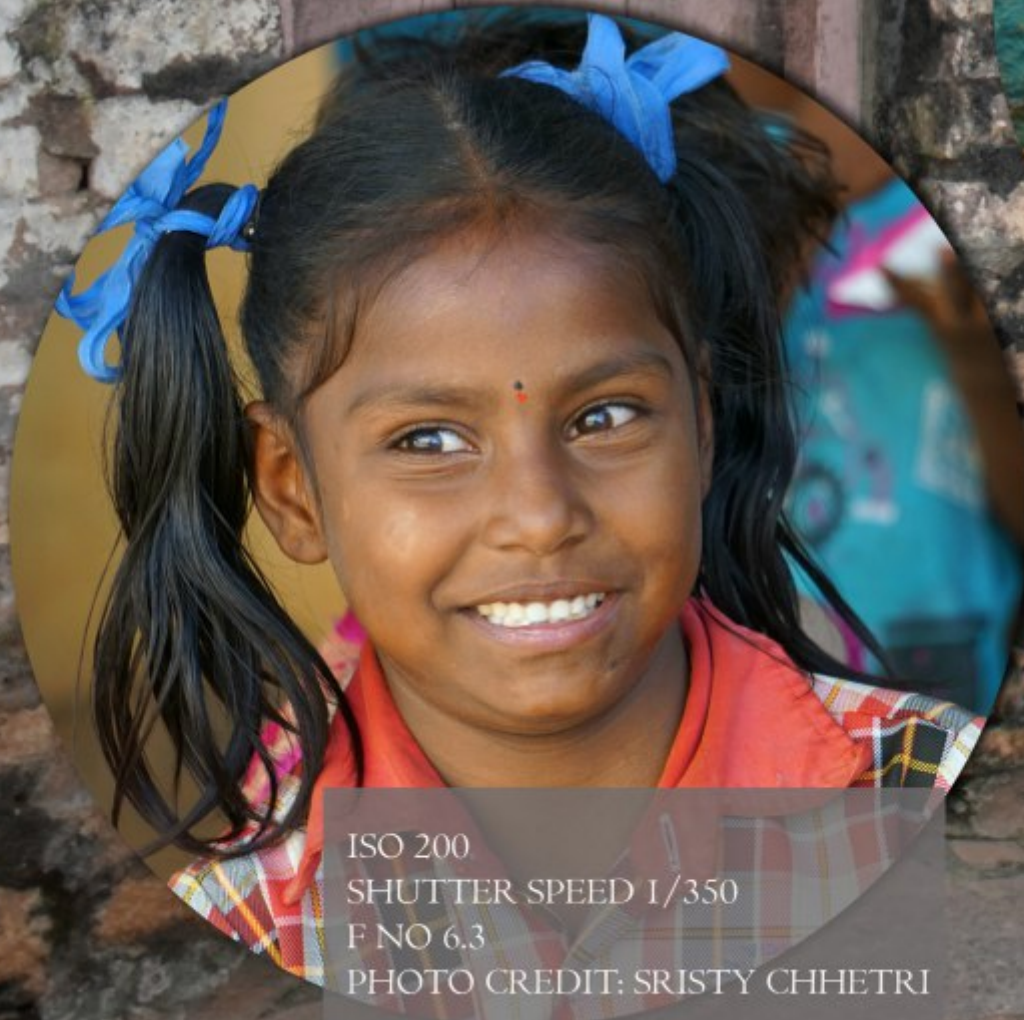
ISO 200 SHUTTER SPEED 1/350 F NO 6.3