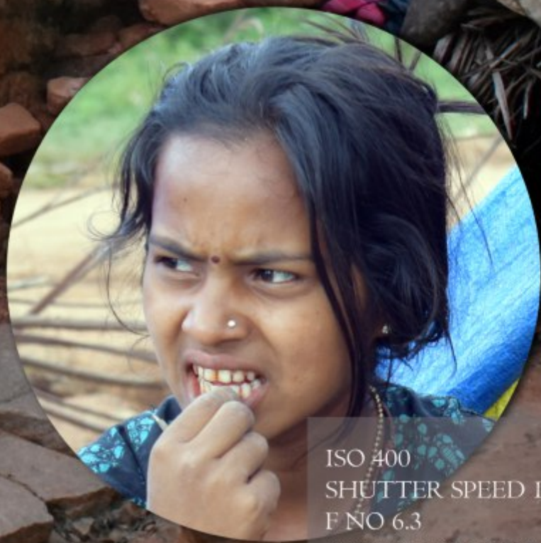
ISO 400 SHUTTER SPEED 1/ 160 F NO 6.3