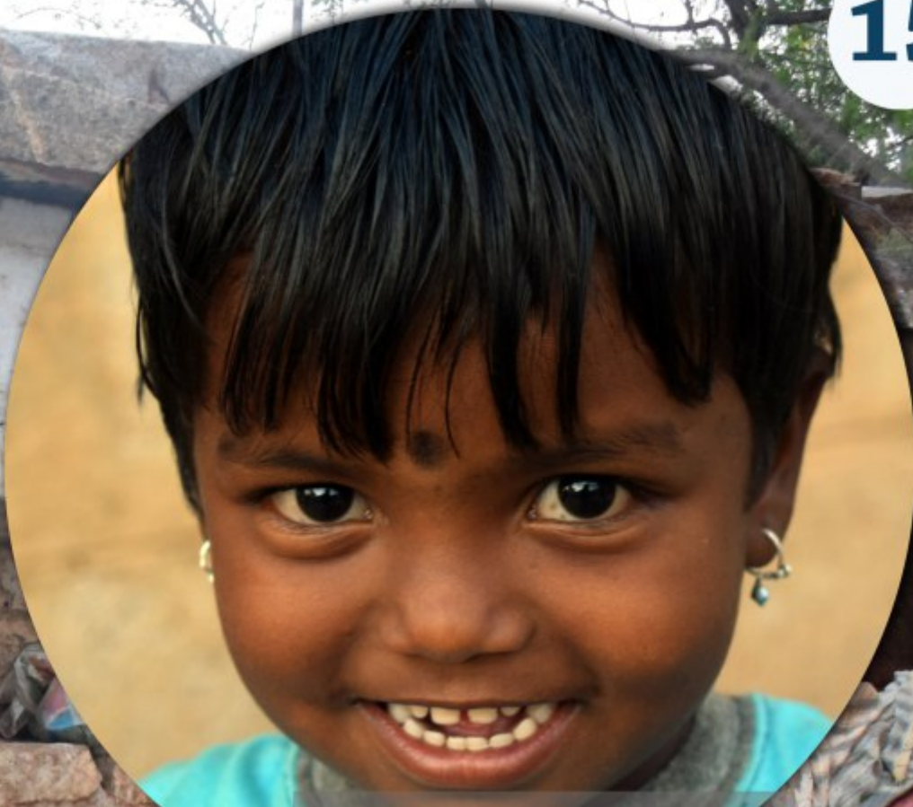
SHUTTER SPEED 1/125 ISO 400 F NO f/5.6