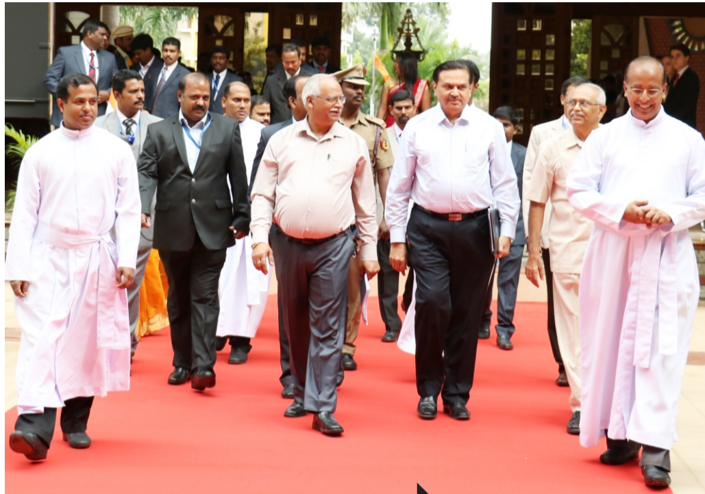
Welcoming the NAAC Peer team members

Kristu Jayanti College Reaccredited with NAAC 'A' Grade