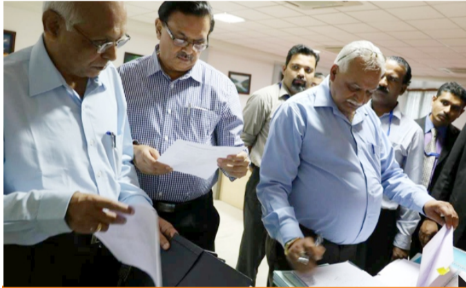
NAAC peer team during their visit to Kristu Jayanti College

This is not the first time that the institution has received the recognition. In the year 2009, the first cycle of accreditation was carried out and was awarded with the same grade. Hence consistency, an exquisite value the institution inculcates among its students and teachers. The