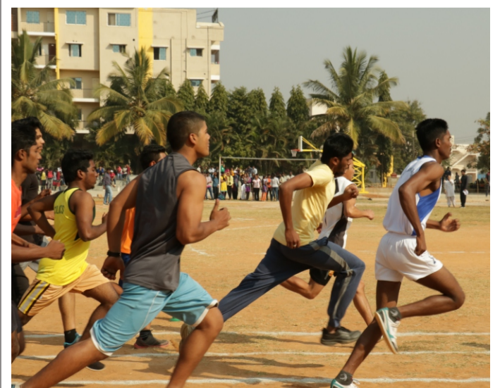
Kridotsava 2016 | Read the full story on page 2