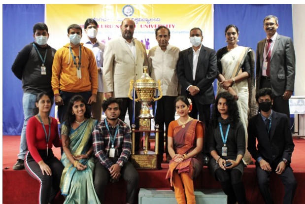
Team KJC with the Championship Trophy