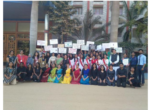
Organizers and Participants