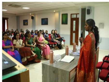
Resource Person Addressing the Participants