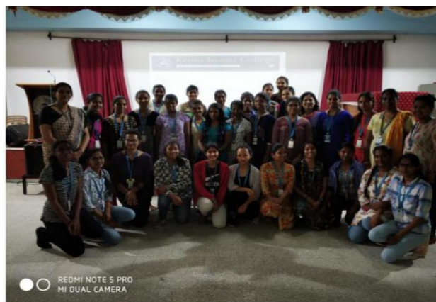
Trainer with Participants