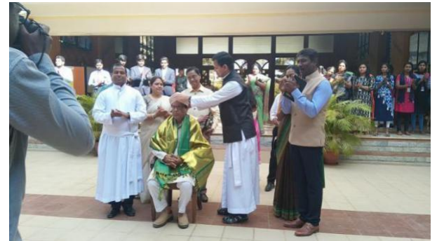
Felicitation of the Chief Guest