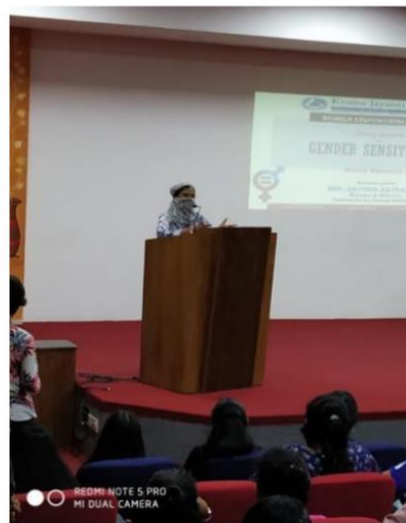
Young Girl sharing her story