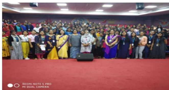
Resource team with students