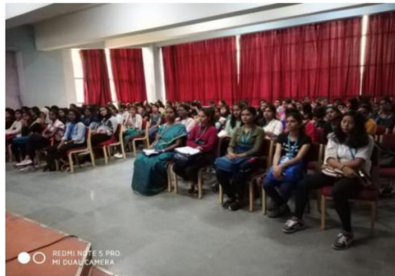
Doctor Addressing the Participants