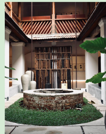
Where Tranquility Meets Architecture