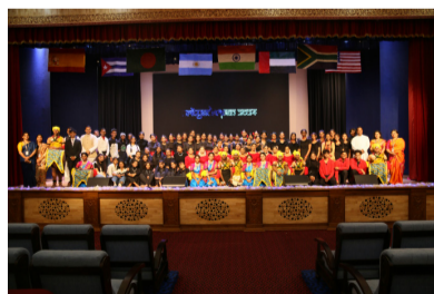
The team of Nityadarpan