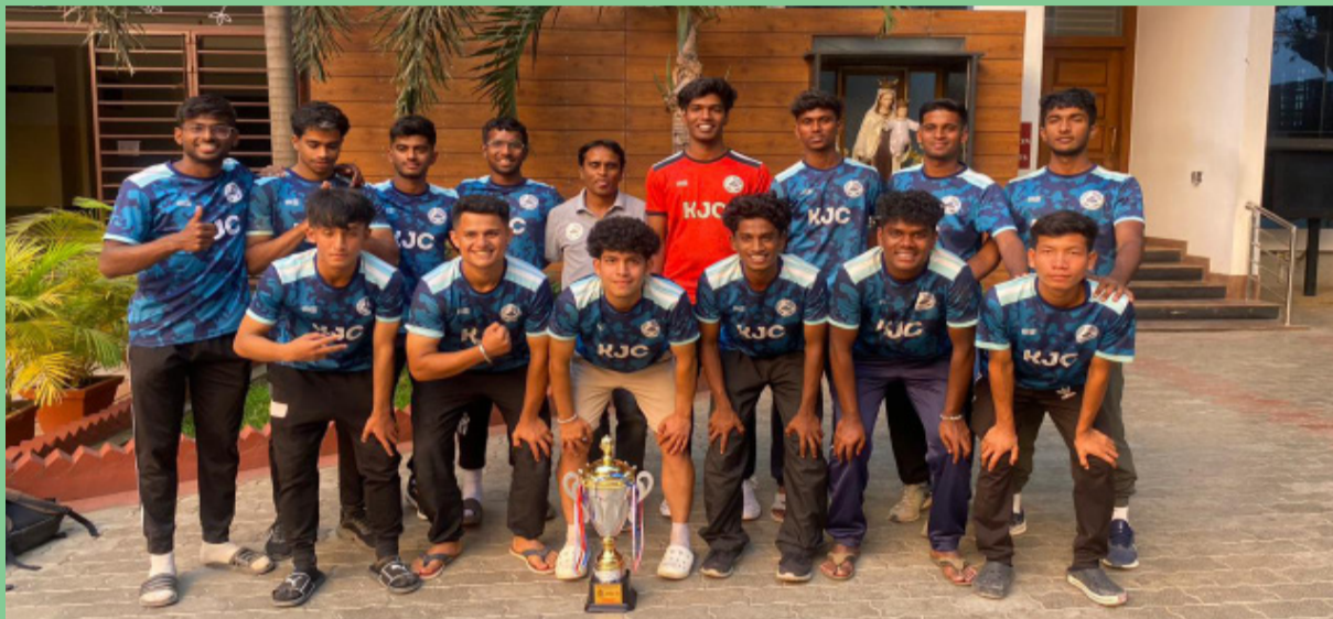
The KJC Football Team After Emerging as Champions at KHEL 2024 Football Tournament