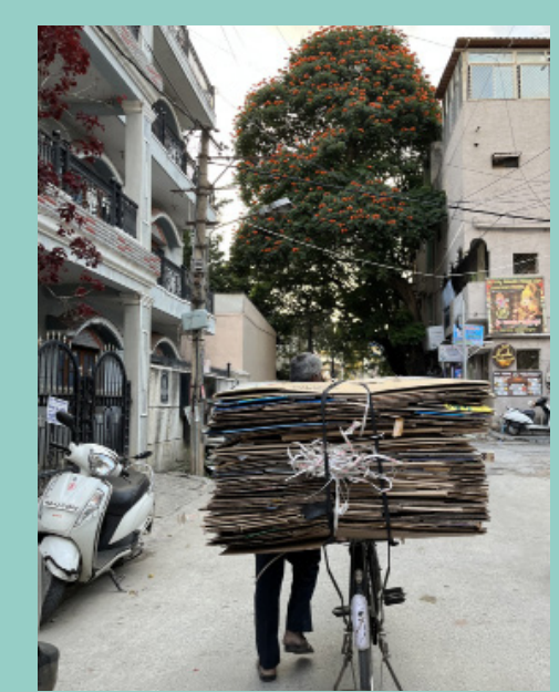
The weight of a lifetime's worth of toil etched into his weary frame Moasunep Pongen