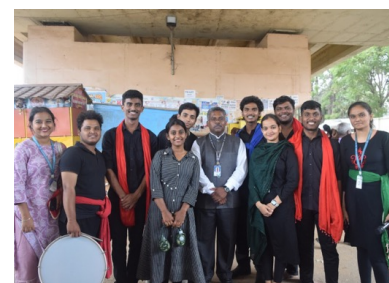
The committee behind the awareness program