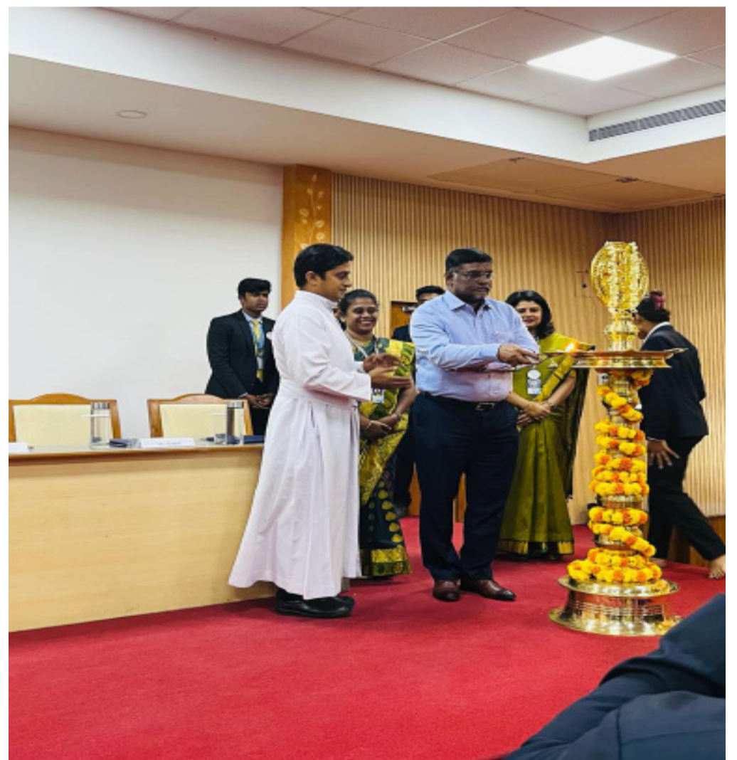
Lighting of the lamp by the chief guest