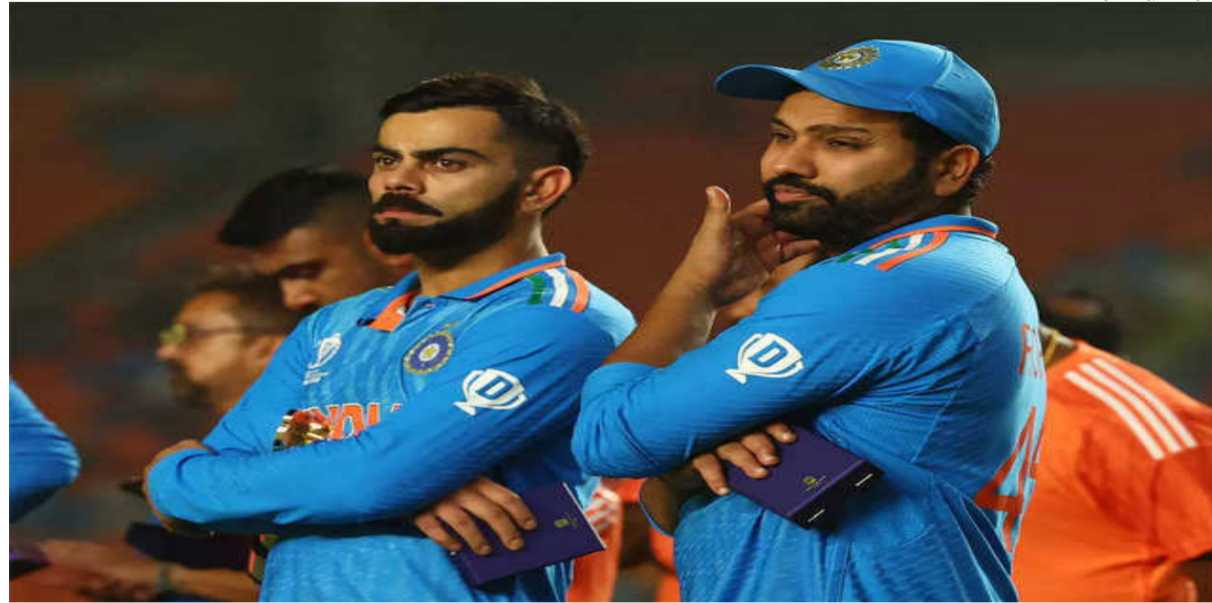
Virat Kohli and Rohit Sharma thinking a strategy for the game.

The 2023 World Cup marked Australia's sixth victory, adding to their previous triumph in 2015. Fans from all corners of the globe, includ-