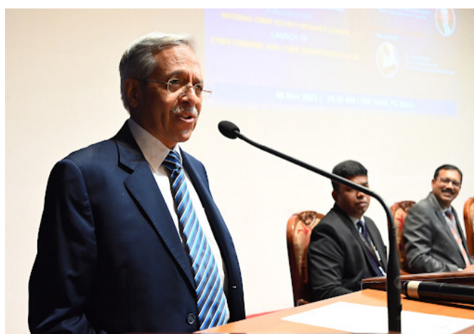
The chief Guest addressing the crowd

He emphasised on the importance of understanding everything and making judgements regarding what is right and what is wrong. To him everyone is a good judge at making decisions.