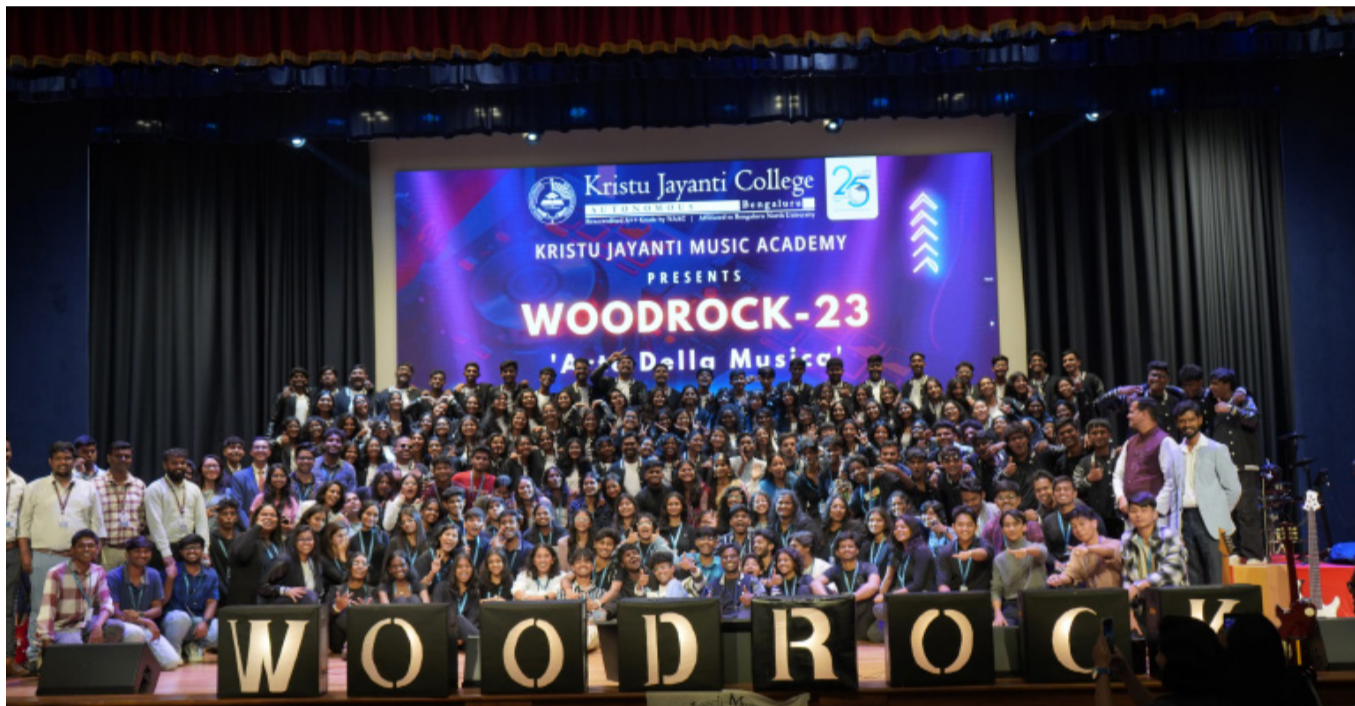
Team Woodrock photograph

Underlining the college’s philosophy of nurturing diverse talents, the KJMA serves as a platform fostering musical skills, offering training programs in vocals and instruments. Wood