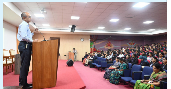
The chief Guest addressing the crowd