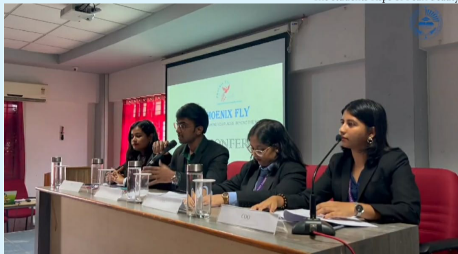
The students Reps of Pearl beauty

Two teams of four students each were formed from the third semester MA JMC class. The first team's topic was – Phoenix Fly Faces Financial Crisis “Phoenix Fly Announces Comprehensive Recovery Plan”. During the press conference, the team—which included the Chief Executive Officer, Chief Financial Officer, Chief Operating Officer, and Public Relations Officer—spoke. In addition to assuring stakeholders of the company's recovery strategies, the students had to be truthful in communicating the financial situation of the organisation. The company's representa-