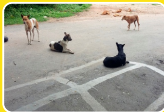
The city of garden now turned into city of stray dogs