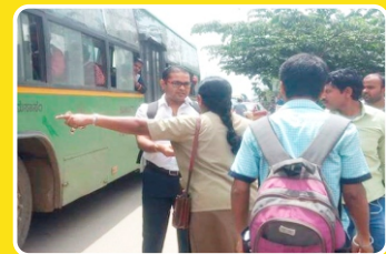
BMTC: The journey of discomfort still continuous