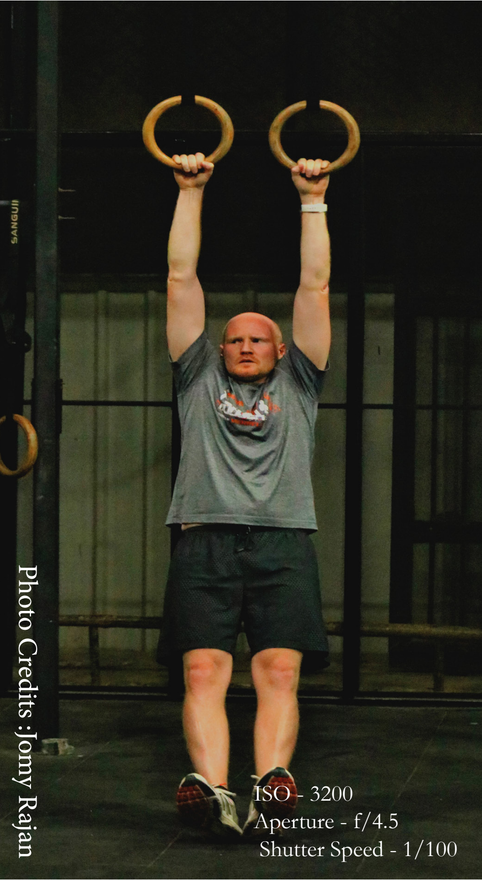
ISO - 3200 Aperture - f/4.5 Shutter Speed - 1/100