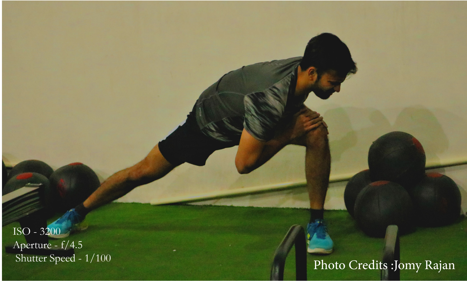
ISO - 3200 Aperture - f/4.5 Shutter Speed - 1/100

These natural, primal, movements influence the exercises included in CrossFit's workouts. We use the term "functional" to describe the exercises utilizing movements most representative of natural movement.