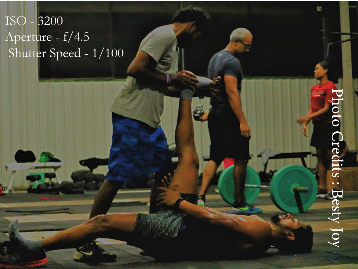
ISO - 3200 Aperture - f/4.5 Shutter Speed - 1/100

CrossFit is a strength and conditioning system built on constantly varied, if not randomized, functional movements executed at high intensity.