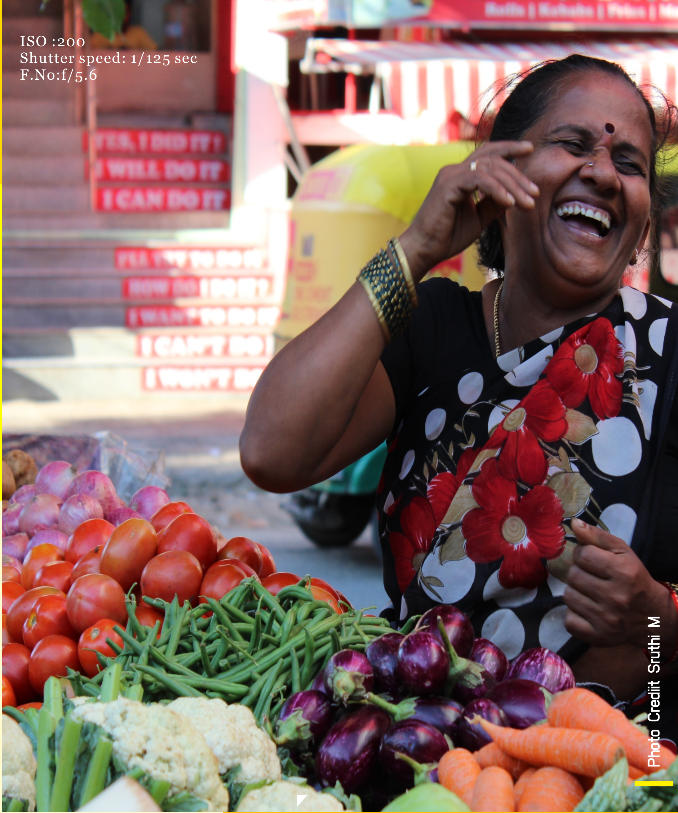
ISO :200 Shutter speed: 1/125 sec F.No:f/5.6