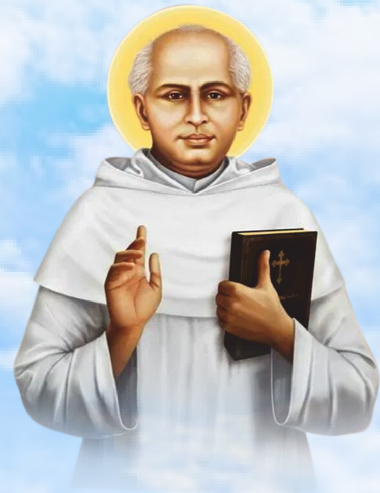
St. Kuriakose Elias Chavara Founder of CMI Congregation