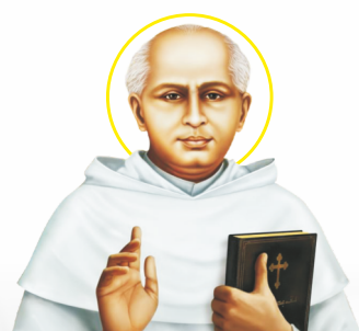
St. Kuriakose Elias Chavara Founder, CMI Congregation