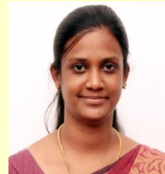
Dr. Excelce International Conference on Paradigm Shift in Global Business