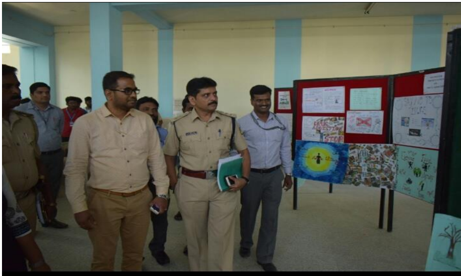
The dignitaries viewing he posters on drug addiction