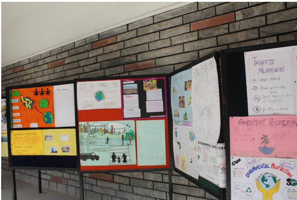
Photo showing the display of the posters