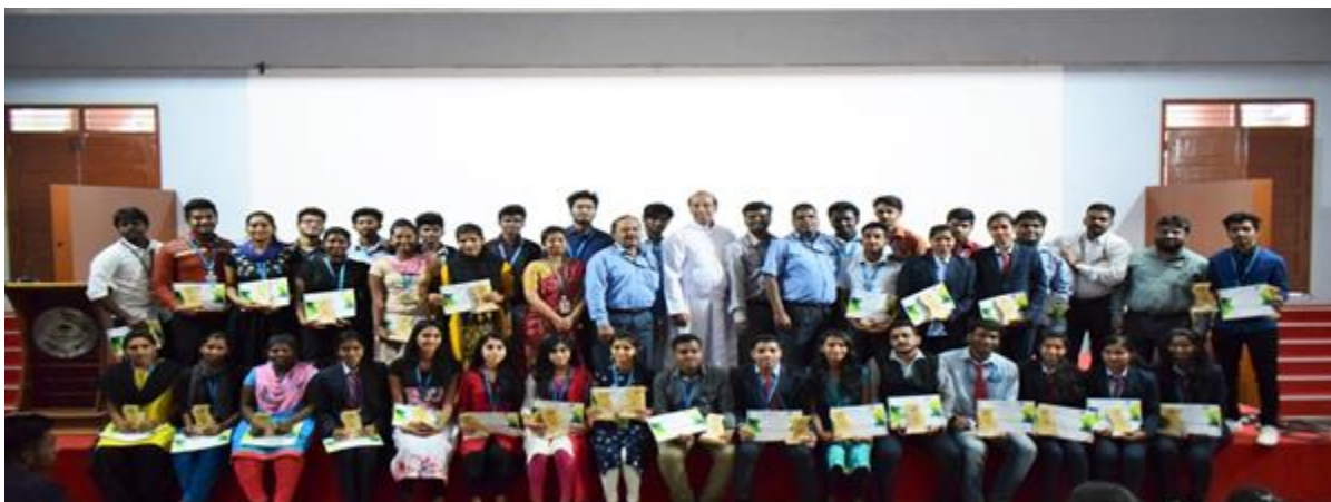
All volunteers with the faculty coordinators