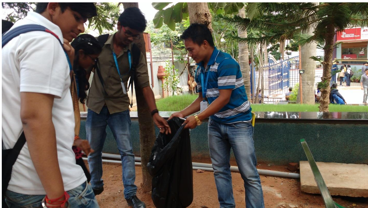
Photo: Students clearing the wastes

The students were instructed to clean all the wastes especially plastics that were lying in and around the campus. This event was conducted with the intention of keeping our campus free of plastics and other wastes.