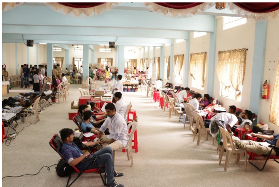
Photo showing the volunteers donating blood.