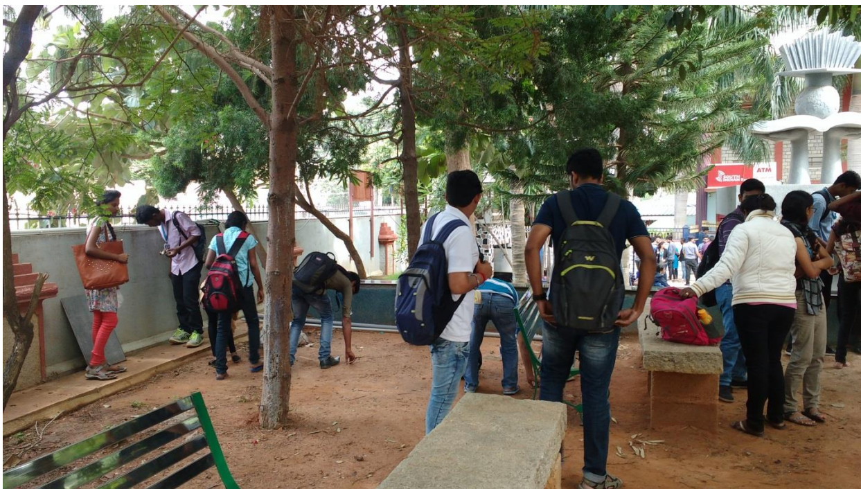
Photo: Students clearing the wastes