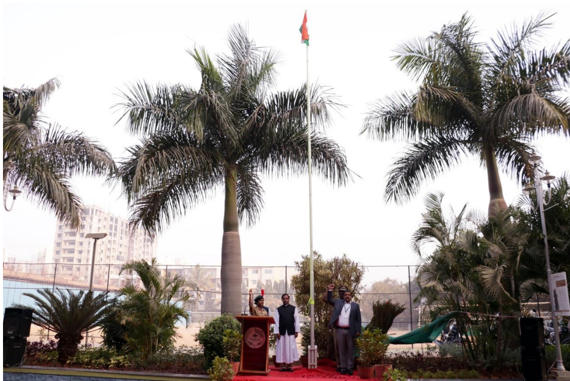
Photo showing the dignitaries paying respect to our National Flag

On this day, in order to inculcate the individual social responsibility and also to safeguard the environment, the NSS volunteers of Kristu Jayanti College took initiative to conduct swachh KJC programme. The students were instructed to clean the campus by clearing the wastes that are lying around. This drive was found to be beneficial.