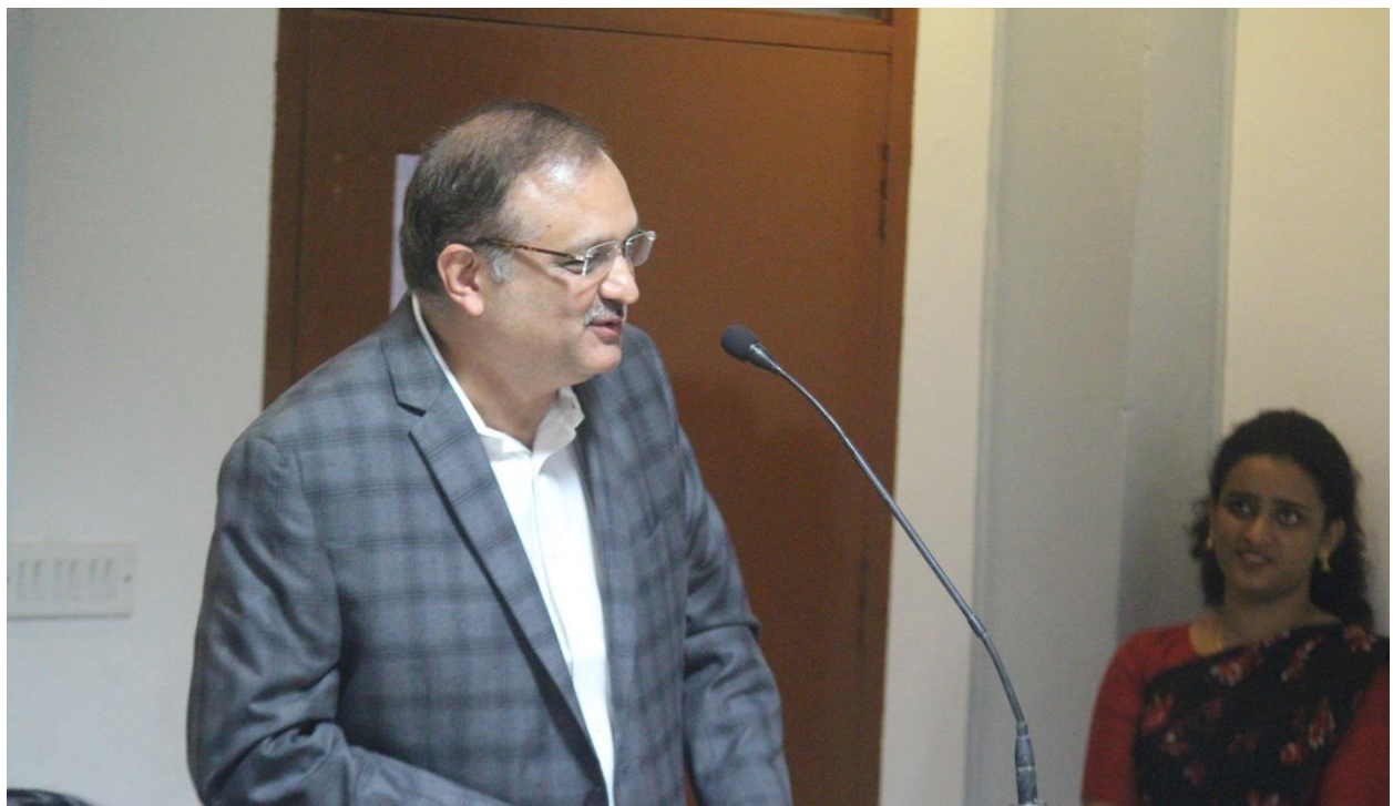
Formal Discussion with Resource person and Jayantian Alumni Entrepreneurs