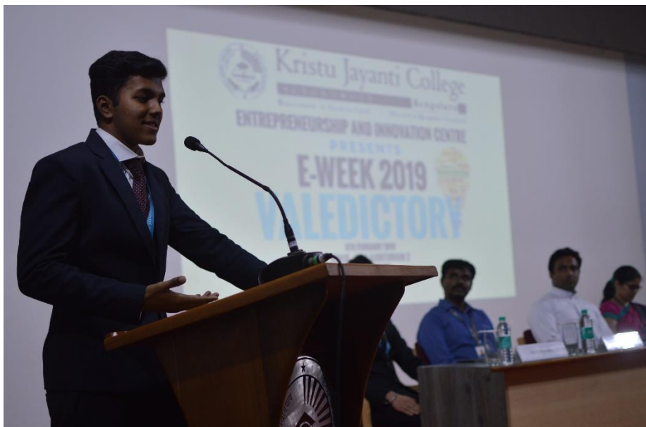
Students participants sharing their views about the event in E-Week, about the problems they faced in the path of becoming an Entrepreneurs