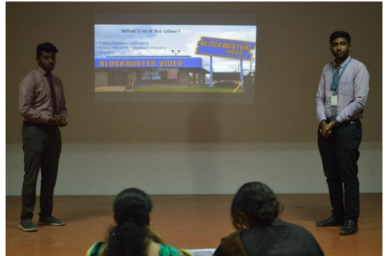
Students presenting their Ideas in E-Week's various events