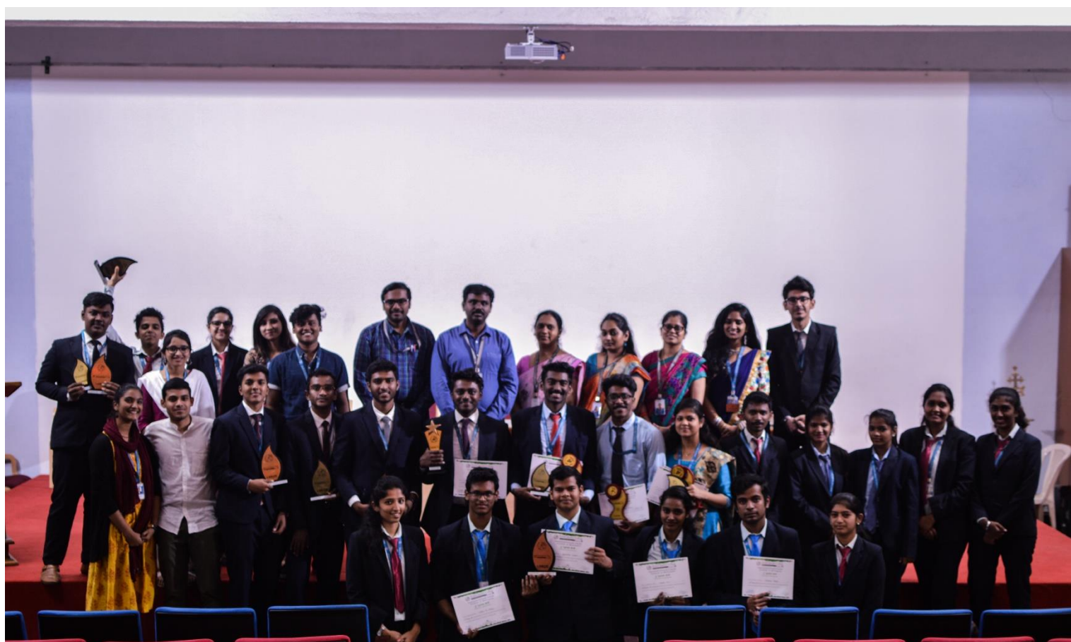
All the Winners of E- Week 2K19 and the Co-ordinators of EIC