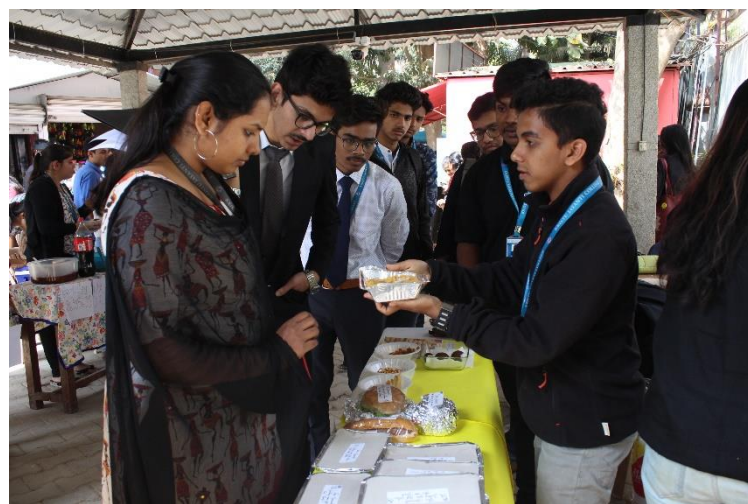
The Judges judging various items of E-Stall