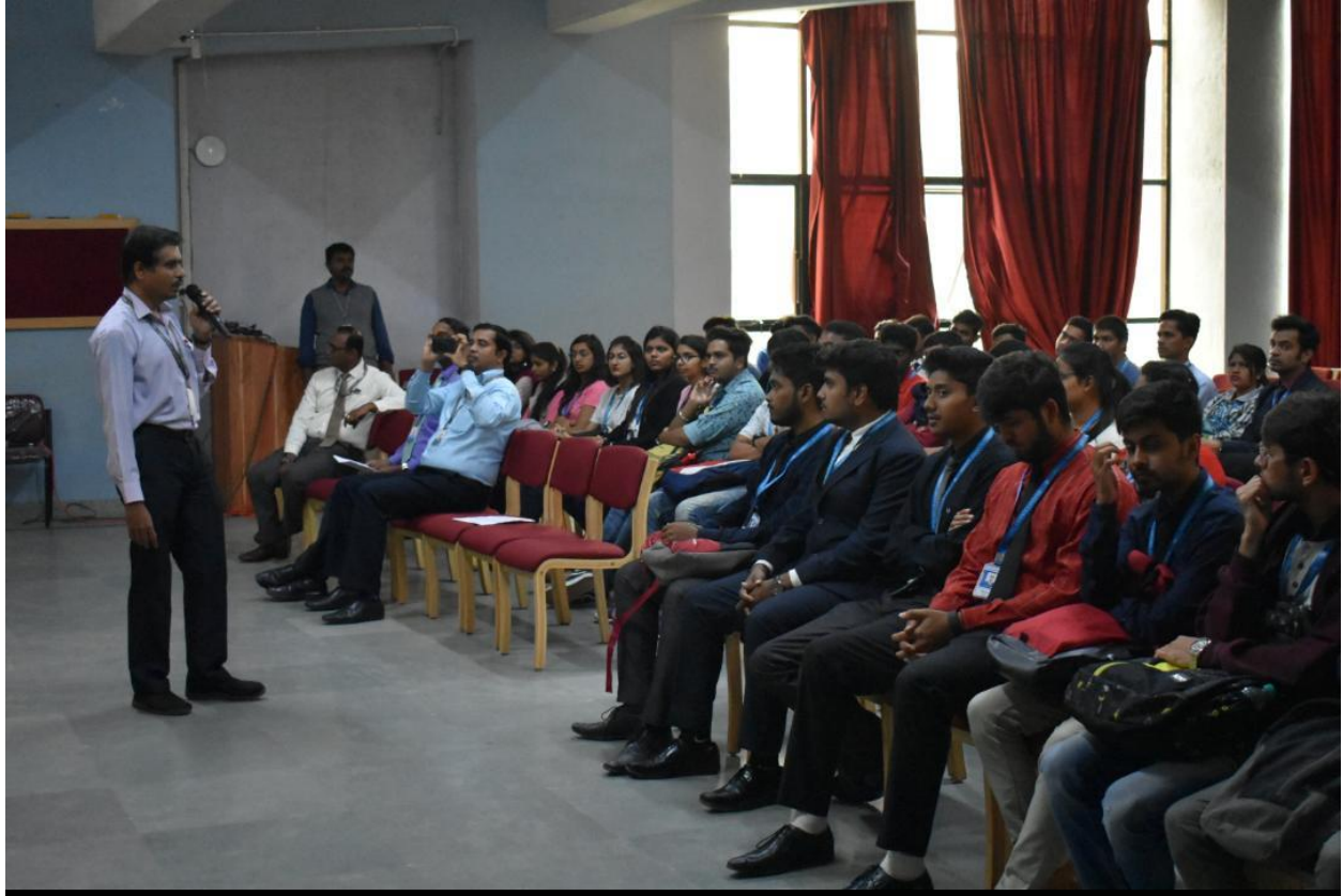
Speakers for the Session interacting with the students