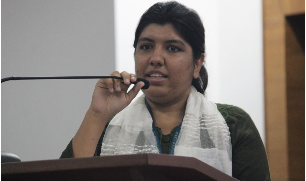
Experience shared by student about her achievement as a member of EIC