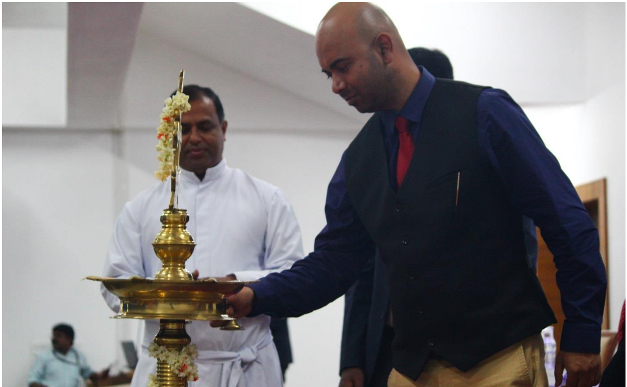
Lamp Lightening by the Diagnotories