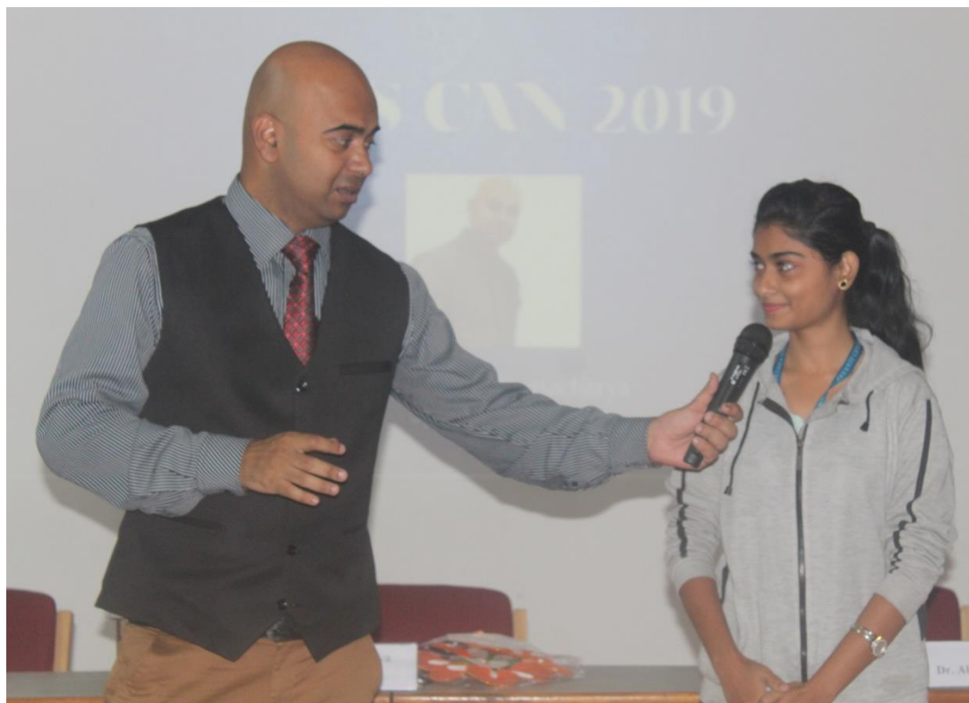
Giving students a situation as entrepreneur to respond