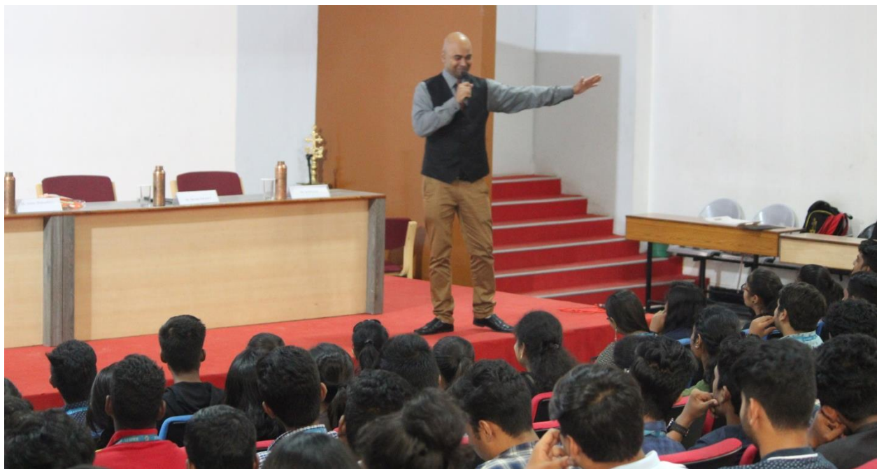
Guest interacting with students