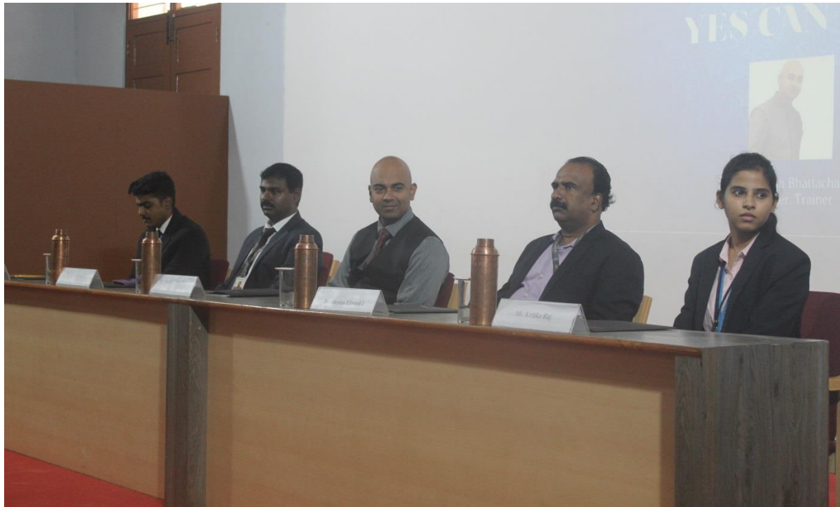
Members on the Dias