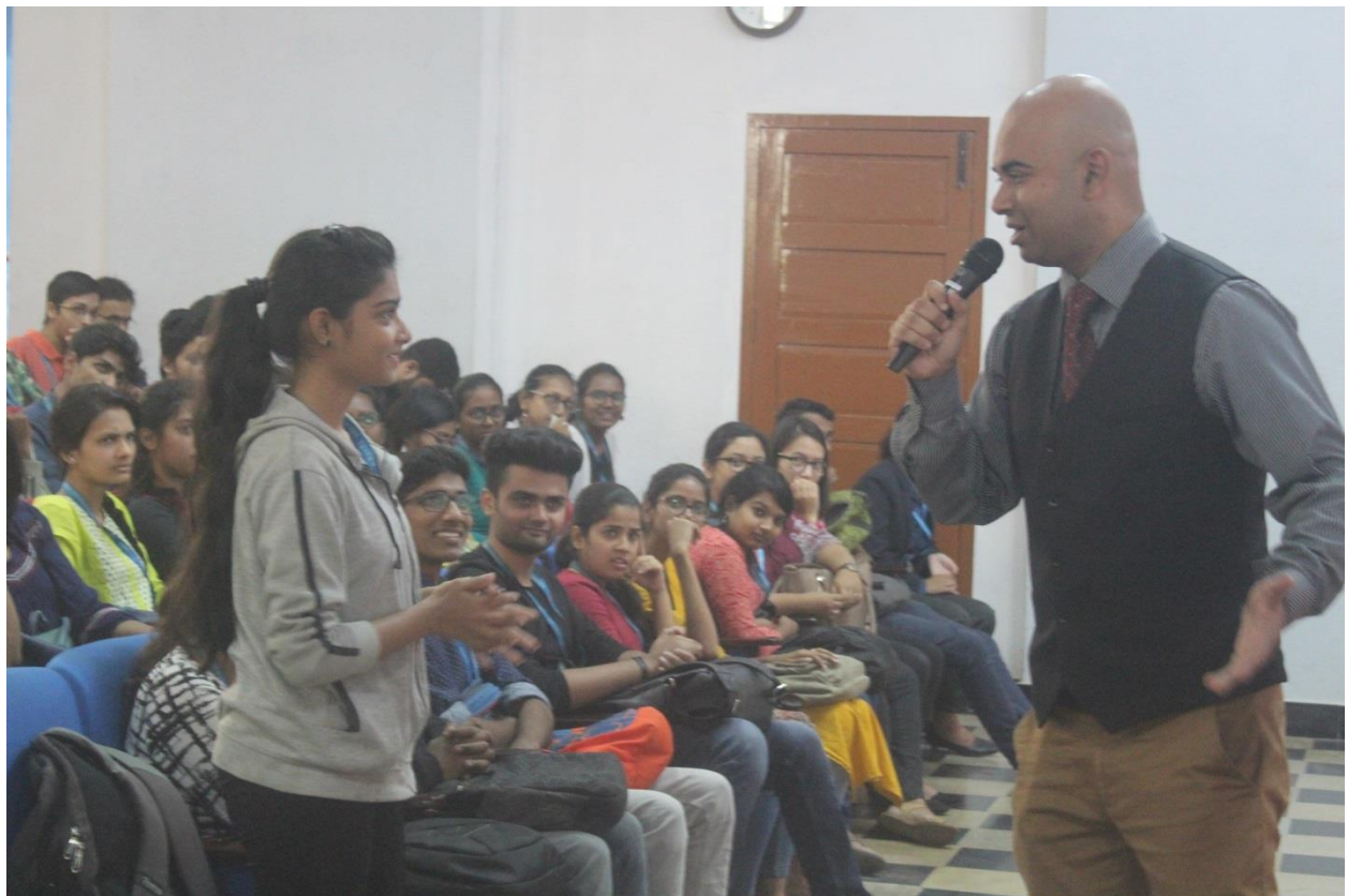
Answering students queries relating to starting a business venture