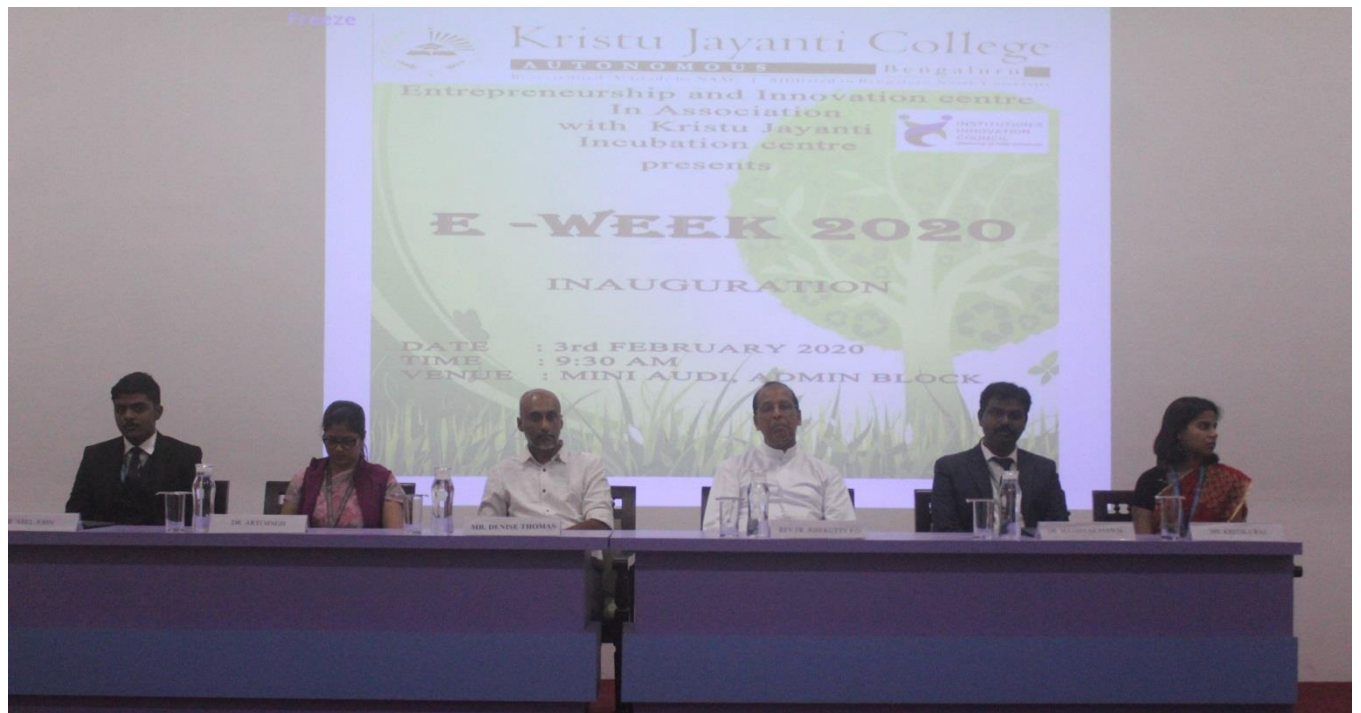
Members on the Dias in Inaugraul Session Of E-Week 2020