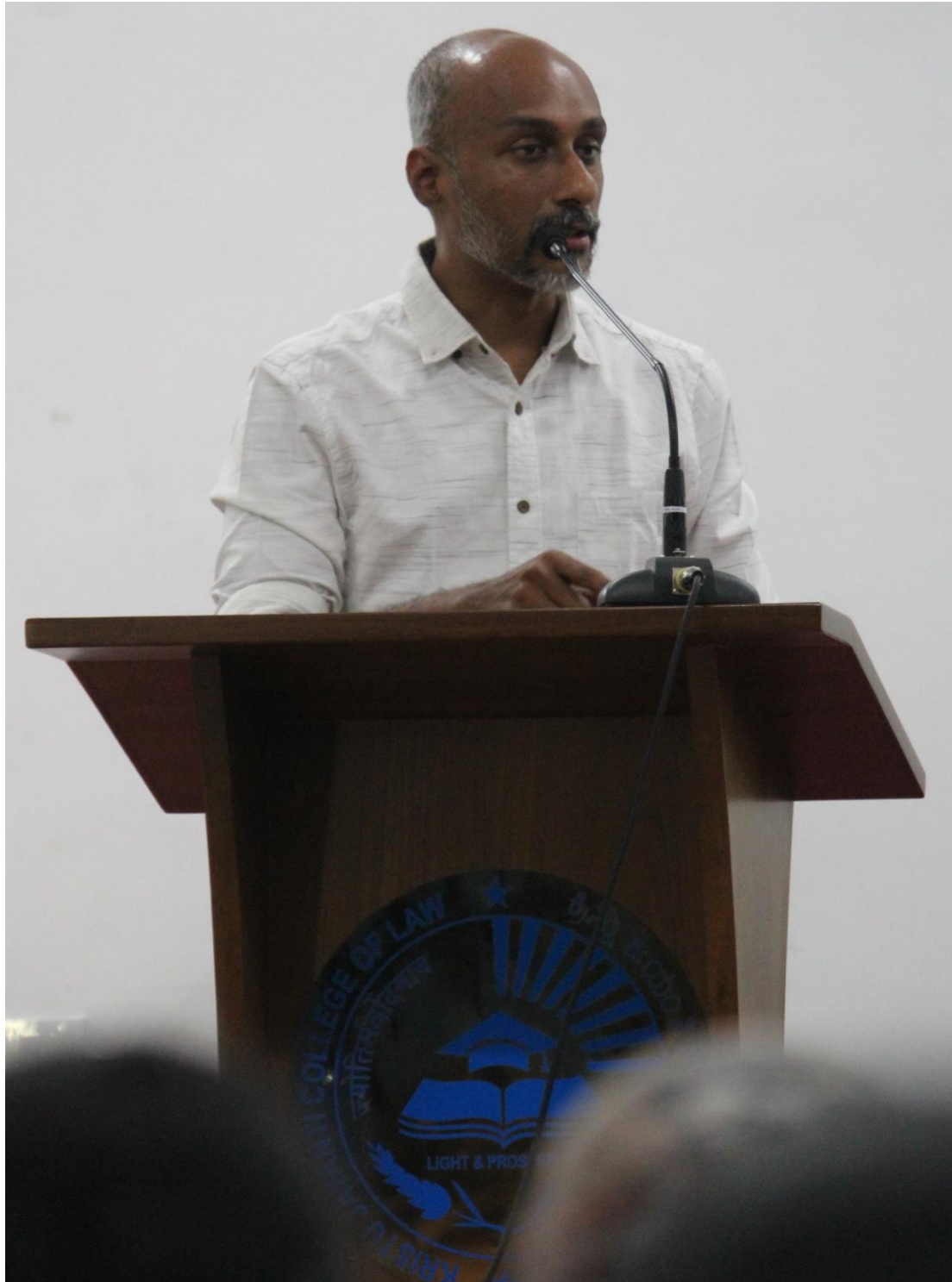
Chief Guest addressing the Students in E-Week