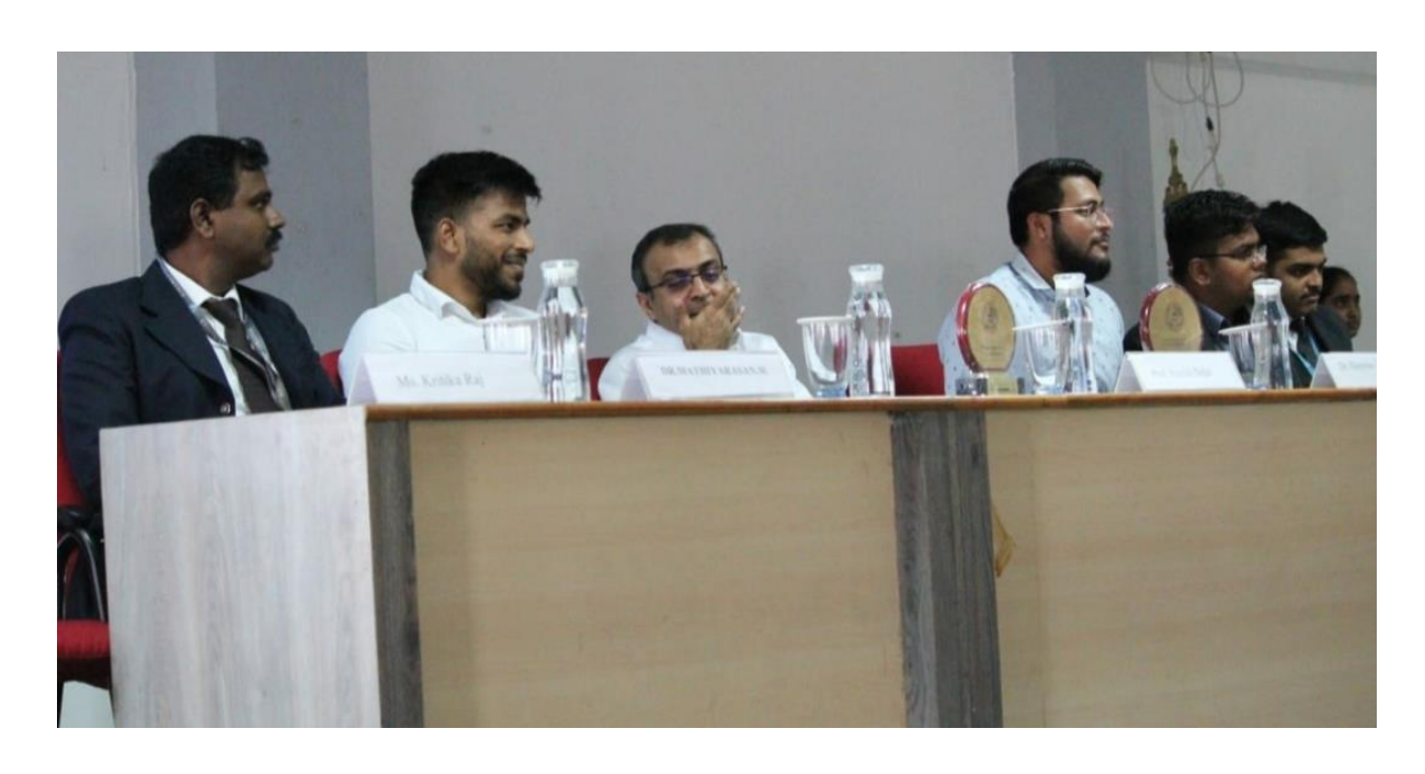
Diagonitories on the Dias