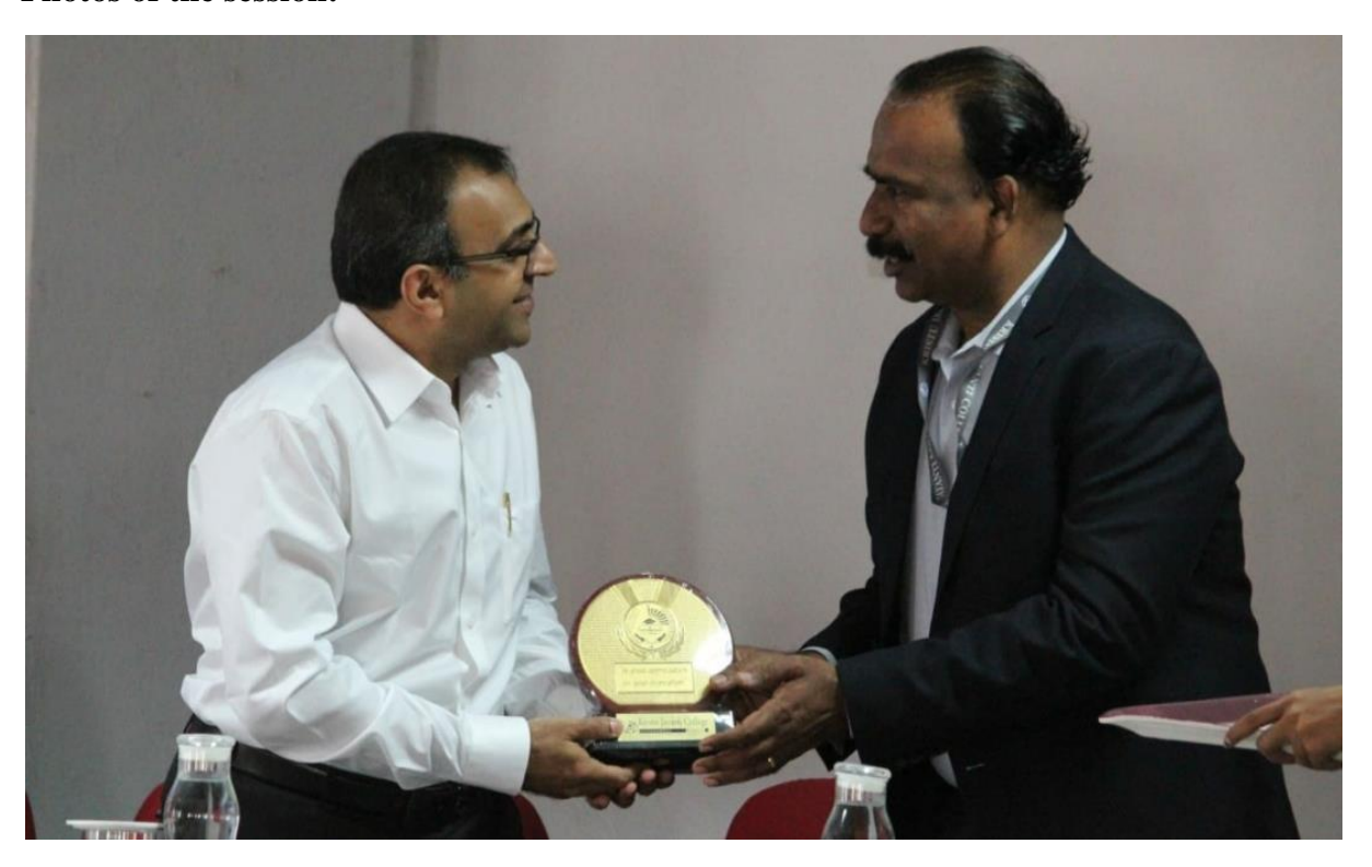
Dean, Department of Commerce & Management presenting momento to chief guest as a tokan of appreciation