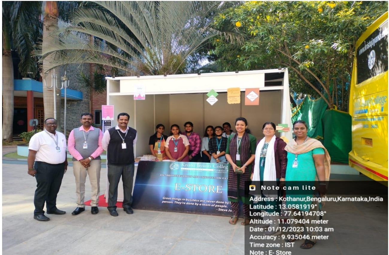
Stall holders and the Faculty Coordinators in the E- Store stalls