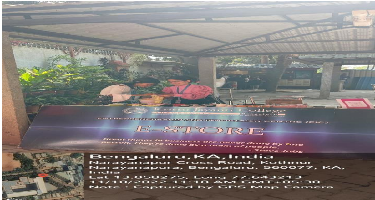
Participants in the stall