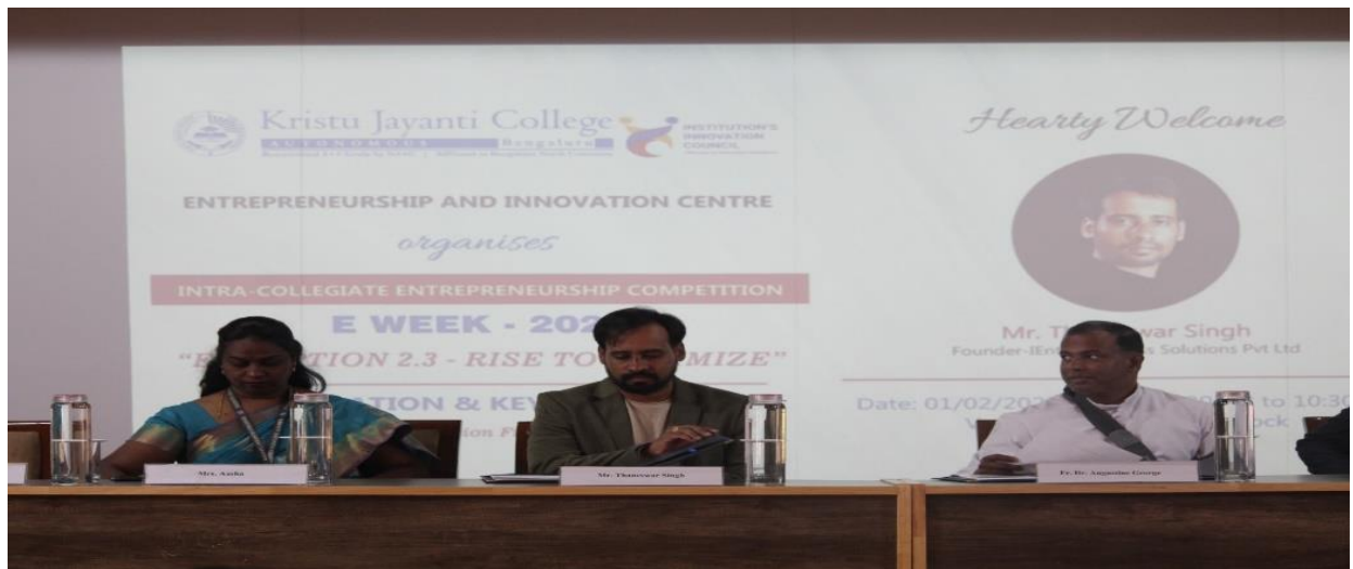
Inauguration of E-Week – 2023