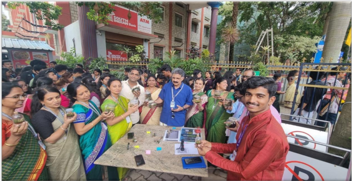
Student selling terrariums in the E-Store stall and faculty members of KJC are visiting the E-store stalls.

Ethnic Day in college is an annual celebration that highlights and honours the cultural diversity within the student body. This event is a vibrant and colourful occasion where students come together to showcase the rich tapestry of traditions, customs, and attire representing various ethnic backgrounds. Food also plays a significant role in Ethnic Day celebrations. Entrepreneurial stores on Ethnic Day often feature a diverse range of products, including handmade crafts, traditional clothing and accessories, artwork, and culturally inspired merchandise. Students may leverage their creativity to design and produce items that reflect the unique aspects of different cultures, providing attendees with an opportunity to explore and appreciate the diversity within the college community.