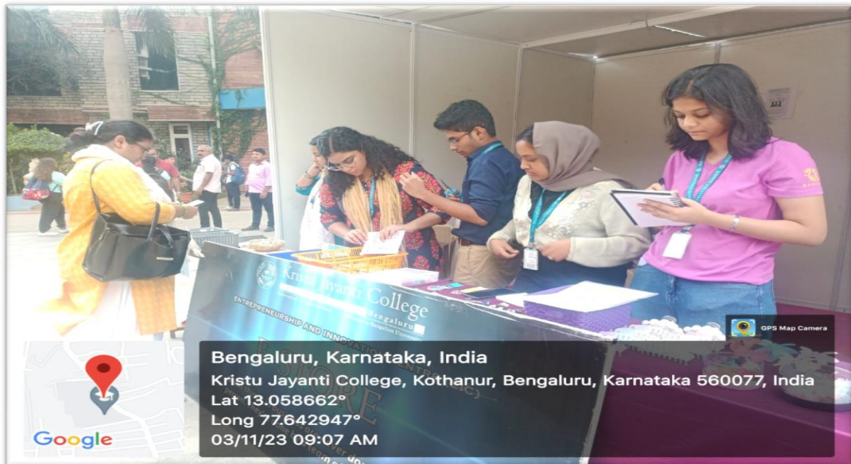
EIC – Students are selling their products.

Aspiring entrepreneurs were given a chance to present their business ideas and gain valuable experience in the business world at the college's entrepreneurial event. Students created a diverse range of business displays. This This immersive experience allowed them to apply their theoretical knowledge in the real world, gaining hands-on experience in various business aspects including investment strategies, marketing techniques, sales tactics, and profit generation. The event was flawlessly executed by the dedicated faculty and student coordinators, ensuring a smooth and successful experience for all participants. The students who took part found the event to be incredibly rewarding, not only in terms of financial gain but also in terms of gaining valuable knowledge and skills that will be beneficial in their future endeavours.