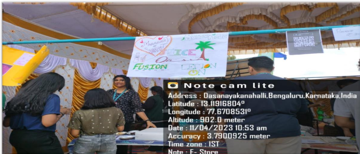
Students are selling the products in the sports day stalls

The college sports day is an annual event that brings together students, faculty, and staff in a celebration of athleticism, teamwork, and healthy competition. Typically organized by a dedicated committee, the sports day features a variety of sporting events and activities. During the sports day event, the Entrepreneurship and Innovation Centre showcases a unique dimension by incorporating students' entrepreneurial stores, adding an exciting and entrepreneurial flair to the festivities. This initiative provides students with the opportunity to showcase their business acumen and creativity, contributing to the overall vibrancy of the event.