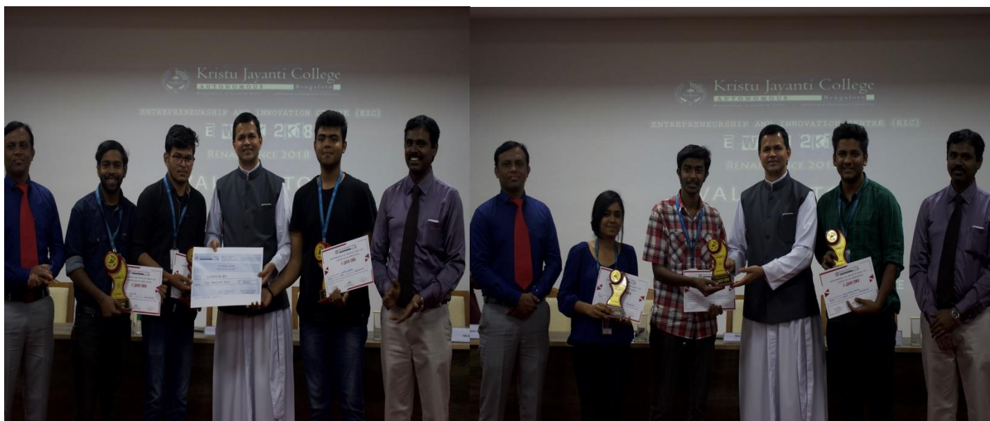
Cash Prize for Best firm