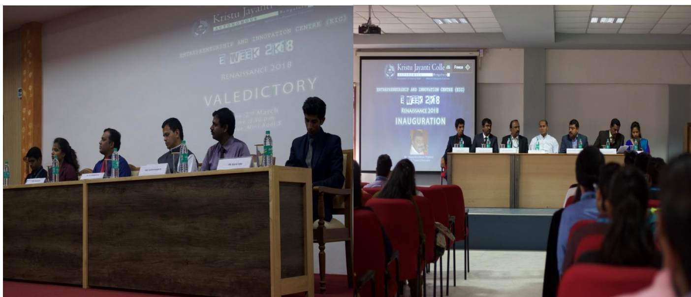
E Week Inauguration and Valedictory