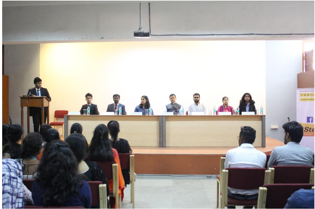
Inauguration ceremony of YESCAN 2018 December