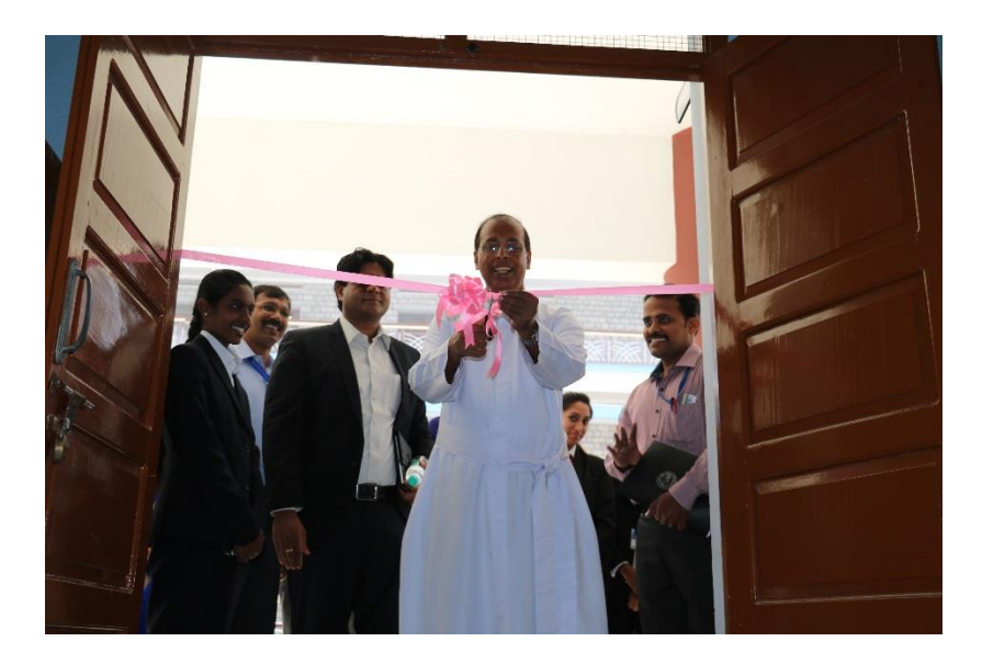
Inauguration by Fr. Principal