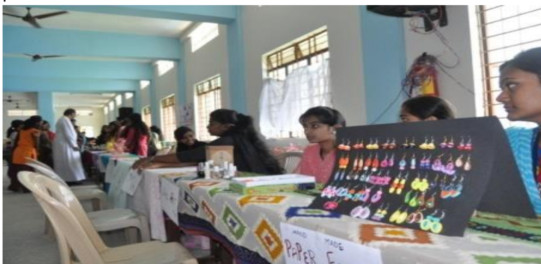
Photo: Students participating in the event