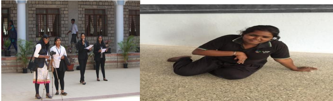
Photo: Students showcasing their talents

Women's Day was celebrated on 8th March 2016 by the Women Empowerment Cell of Kristu Jayanti College. A skit was performed by the students to showcase the women who have brought about remarkable changes in today's world. After the skit, the Women Empowerment Cell conducted "Girls Got Talent" which provided a platform for the girls of Kristu Jayanti to exhibit their talents. Altogether, the event was successful in its aim to give a platform to the women in the college to showcase and pursue their skills and interests apart from academics and thus encouraging, empowering and equipping them.