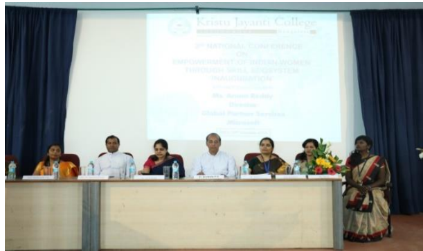
Photo: Presidential address by the Chief Guest