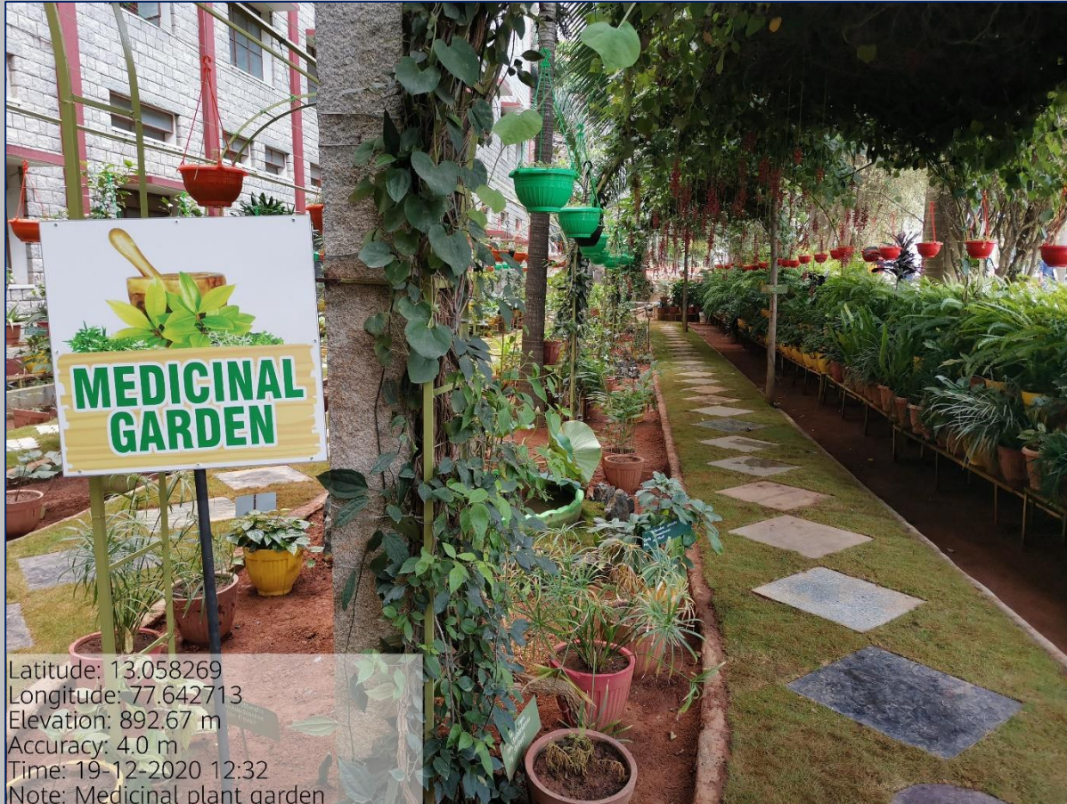
Latitude: 13.058269 Longitude: 77.642713 Elevation: 892.67 m Accuracy: 4.0 m Time: 19-12-2020 12:32 Note: Medicinal plant garden

AUTONOMOUS Bengaluru Reaccredited 'A' Grade by NAAC | Affiliated to Bangalore North University