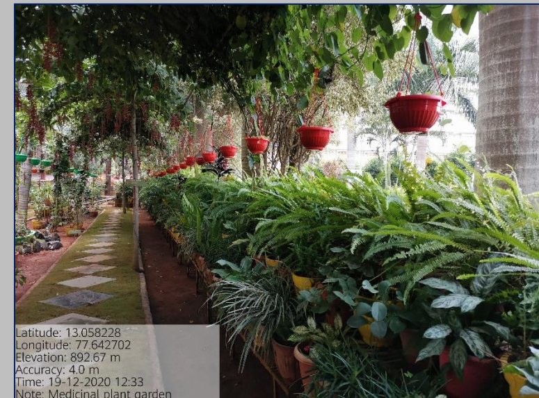
Latitude: 13.058228 Longitude: 77.642702 Elevation: 892.67 m Accuracy: 4.0 m Time: 19-12-2020 12:33 Note: Medicinal plant garden