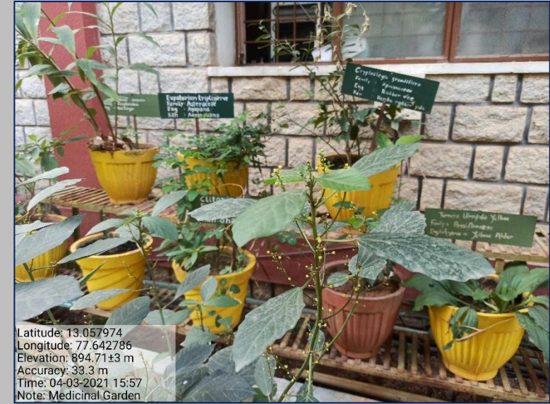
Latitude: 13.057974 Longitude: 77.642786 Elevation: 894.71±3 m Accuracy: 33.3 m Time: 04-03-2021 15:57 Note: Medicinal Garden