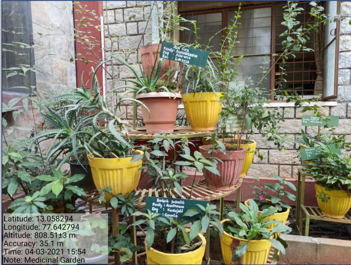
Latitude: 13.058294 Longitude: 77.642794 Altitude: 808.51±3 m Accuracy: 35.1 m Time: 04-03-2021 15:54 Note: Medicinal Garden

AUTONOMOUS Bengaluru Reaccredited 'A' Grade by NAAC | Affiliated to Bangalore North University