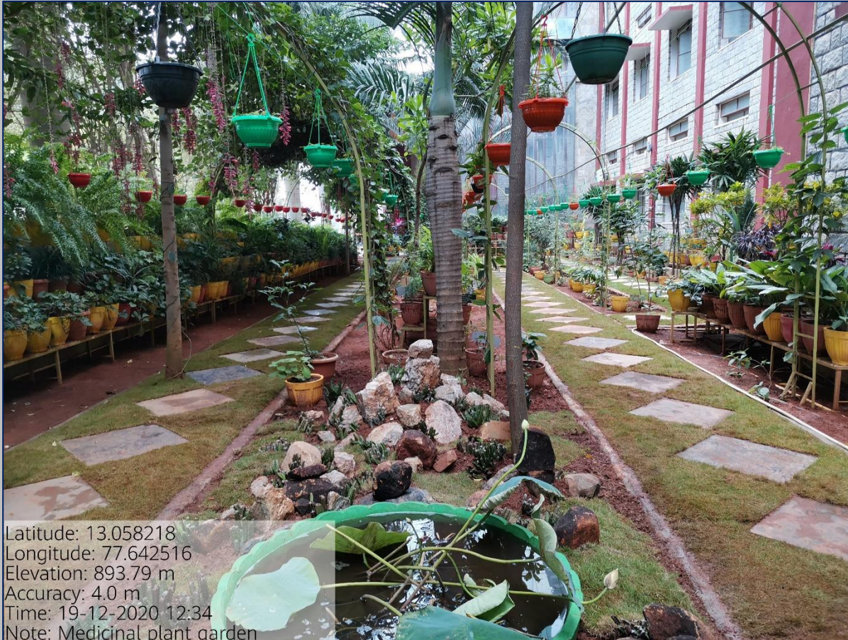
Latitude: 13.058218 Longitude: 77.642516 Elevation: 893.79 m Accuracy: 4.0 m Time: 19-12-2020 12:34 Note: Medicinal plant garden

Reaccredited 'A' Grade by NAAC | Affiliated to Bangalore North University