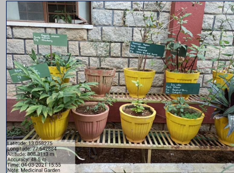
Latitude: 13.058275 Longitude: 77.642884 Altitude: 808.31±3 m Accuracy: 48.5 m Time: 04-03-2021 15:55 Note: Medicinal Garden