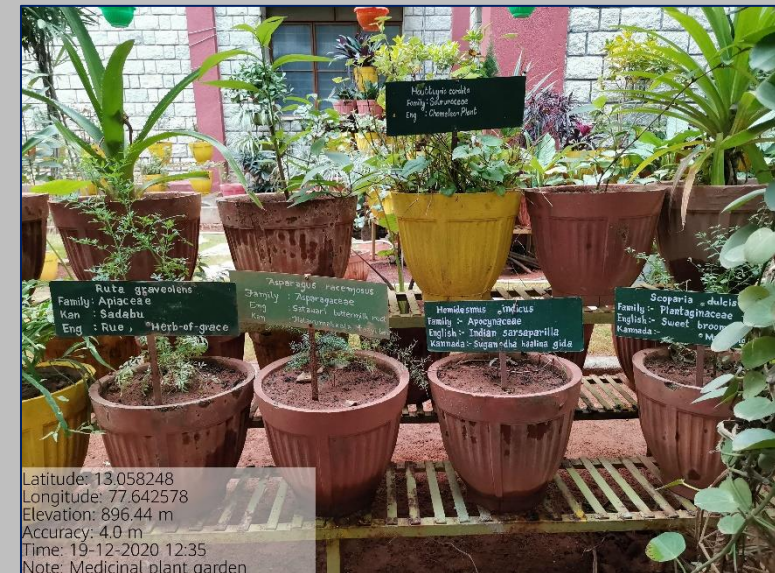
Latitude: 13.058248 Longitude: 77.642578 Elevation: 896.44 m Accuracy: 4.0 m Time: 19-12-2020 12:35 Note: Medicinal plant garden