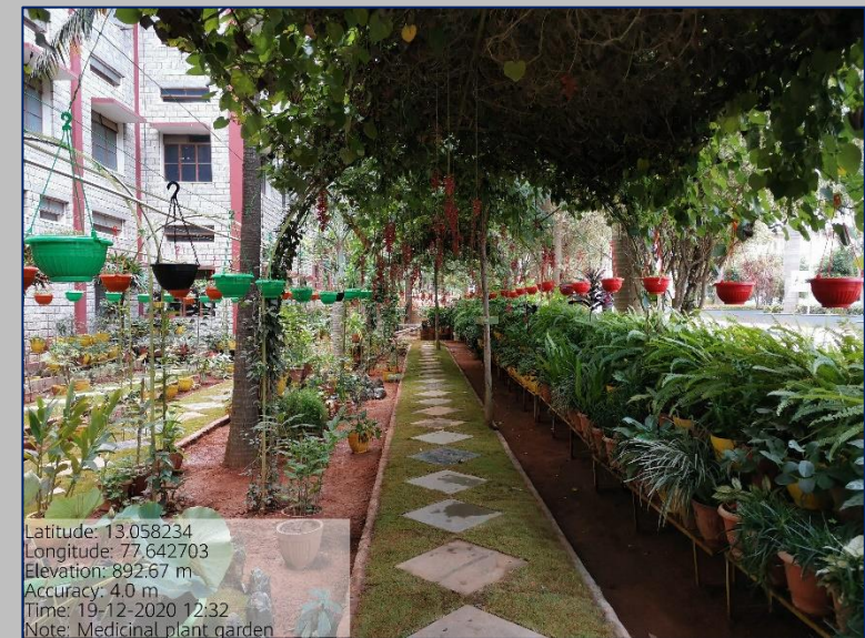
Latitude: 13.058234 Longitude: 77.642703 Elevation: 892.67 m Accuracy: 4.0 m Time: 19-12-2020 12:32 Note: Medicinal plant garden