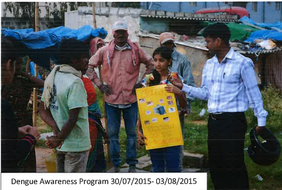
Dengue Awareness Program 30/07/2015- 03/08/2015

The Five-day Dengue Awareness Program from Thursday, July 30 th 2015 to Monday, August 3 rd 2015 was conducted by the NSS Unit of Kristu Jayanti College. The students were accompanied by the staff coordinators. This Awareness Program was conducted in the neighborhood villages which included Narayanapura, Geddalahalli, Nagenahalli, Kothanur and Byrathi.