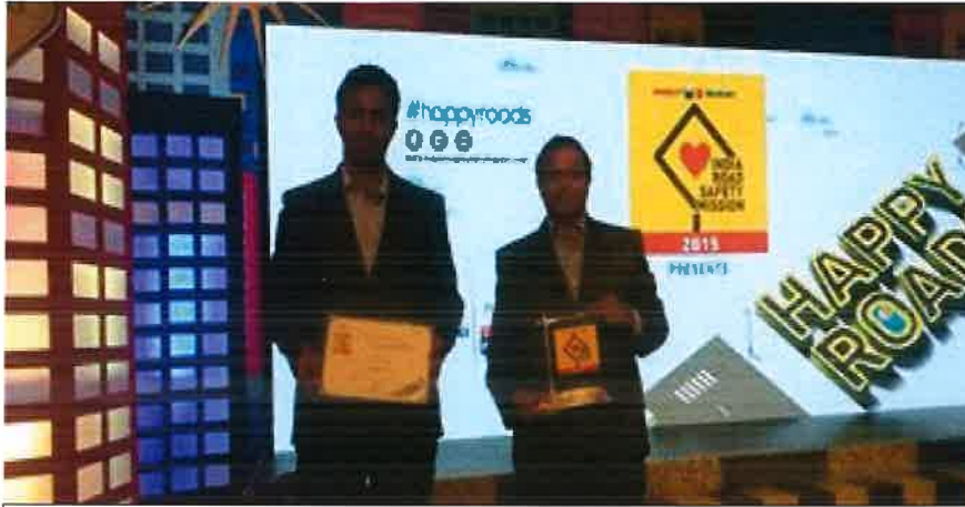
National Winner of Maruti Suzuki India Road Safety Mission Award 2015 17-12-2015