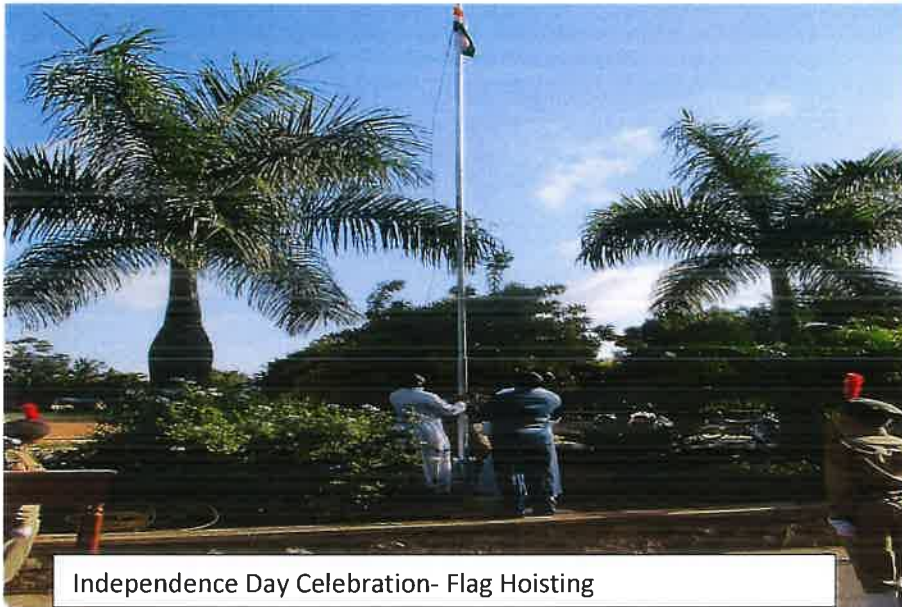
Independence Day Celebration- Flag Hoisting