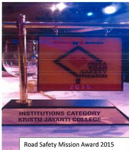
Road Safety Mission Award 2015

The Road Safety Campaign was conducted by the NSS Unit on 17 th December 2015. All the College students took oath in the College Quadrangle to follow rules and regulations of Road Safety. Times Now Channel was present to cover the event. The poster presentation was organized by the NSS Unit in Mini Auditorium 1 to sensitize the students of the different road signs and the bad effects of not following road safety. A Bike Rally was also organized by the volunteers to promote road safety in the nearby areas of Narayanpura. The College was announced as ‘National Winner of Maruti Suzuki India Road Safety Mission Award 2015 [Institutions Category] for contributing towards Road Safety awareness.