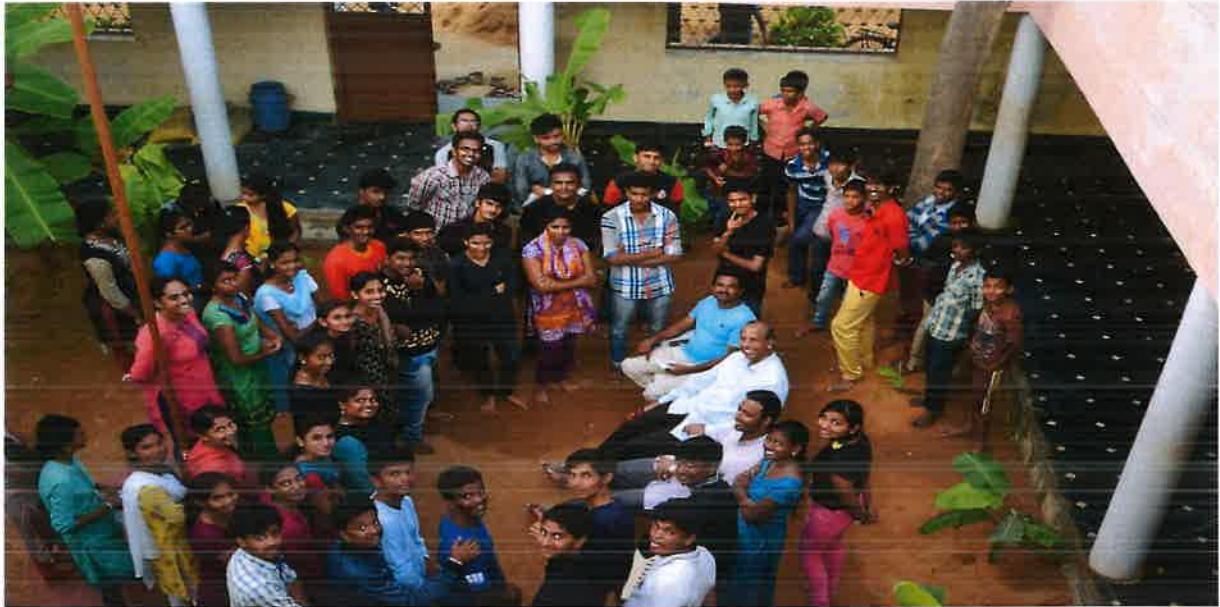
Principal interacting with volunteers in CSA Rural Exposure Camp 2015.