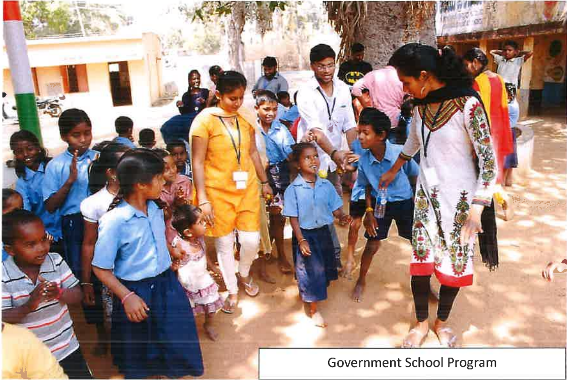
Government School Program