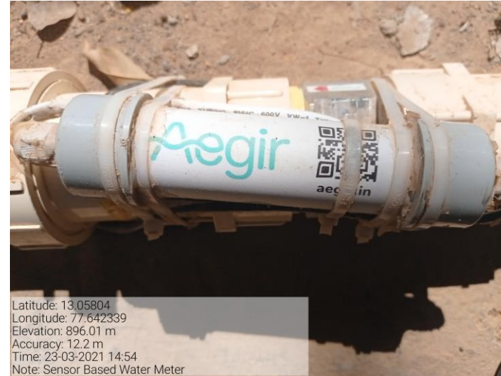
Latitude: 13.05804 Longitude: 77.642339 Elevation: 896.01 m Accuracy: 12.2 m Time: 23-03-2021 14:54 Note: Sensor Based Water Meter