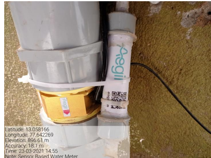
Latitude: 13.058166 Longitude: 77.642269 Elevation: 896.61 m Accuracy: 18.1 m Time: 23-03-2021 14:55 Note: Sensor Based Water Meter