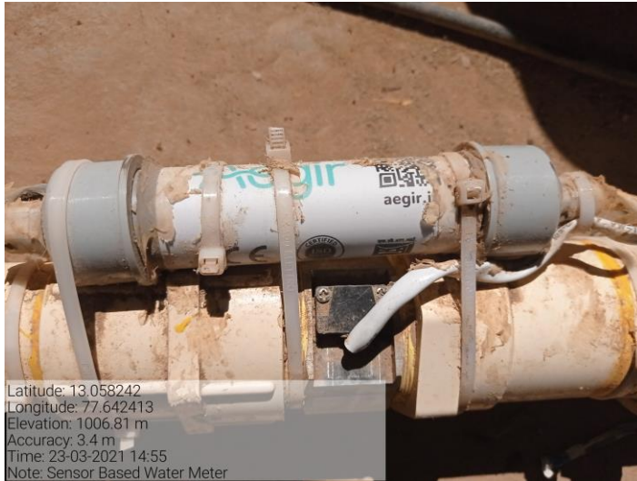
Latitude: 13.058242 Longitude: 77.642413 Elevation: 1006.81 m Accuracy: 3.4 m Time: 23-03-2021 14:55 Note: Sensor Based Water Meter