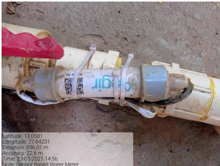
Latitude: 13.0581 Longitude: 77.64231 Elevation: 896.01 m Accuracy: 22.6 m Time: 23-03-2021 14:56 Note: Sensor Based Water Meter