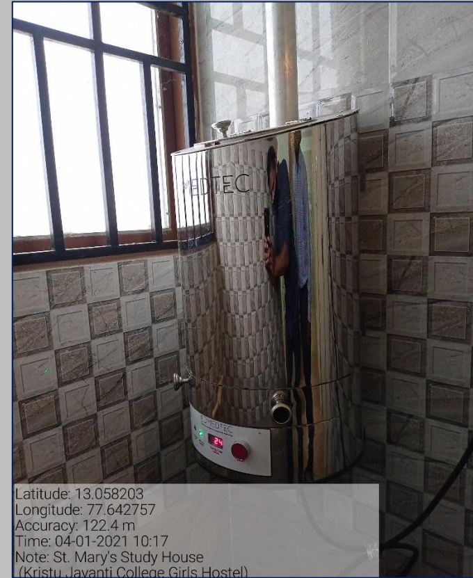
St. Mary's Study House-Girls Hostel

Latitude: 13.058203 Longitude: 77.642757 Accuracy: 122.4 m Time: 04-01-2021 10:17 Note: St. Mary's Study House (Kristu Jayanti College Girls Hostel)