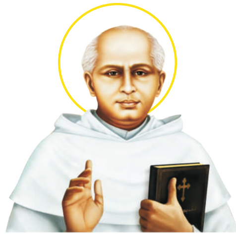
St. Kuriakose Elias Chavara Founder, CMI Congregation

Kristu Jayanti College is reaccredited by NAAC with a Grade of 'A++' with a CGPA score of 3.78 out of 4 in its third cycle of accreditation in 2021. The College is an autonomous institution affiliated to Bengaluru North University. The Business School is accredited by ACBSP – Accreditation Council for Business Schools and Programmes, USA.