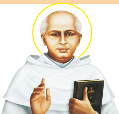
St. Kuriakose Elias Chavara Founder, CMI Congregation